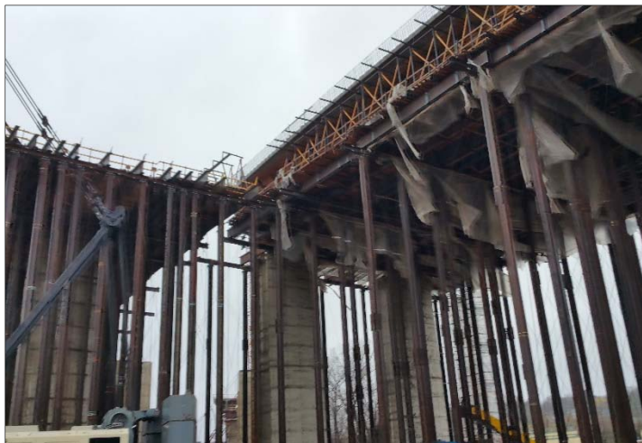
b. EB gore area: installing bottom slab pour 1 rebar & Pier 4E diaphragm rebar