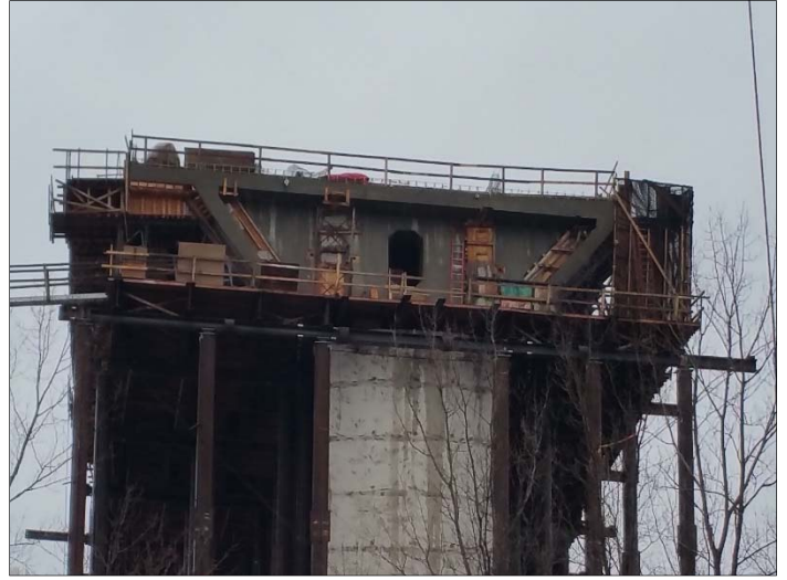
a. WB gore area: pour-backs complete, falsework removal ongoing