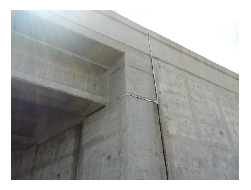
Bridge B-67-325 Northwest Wingwall & Superstructure