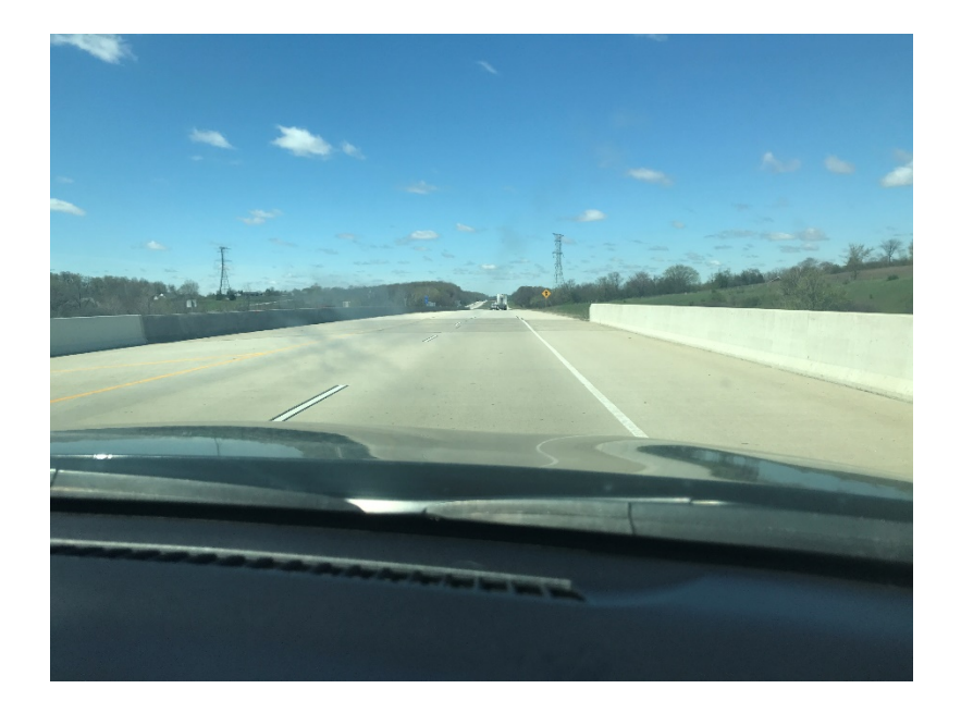
Bridge B-67-325 Top of Deck