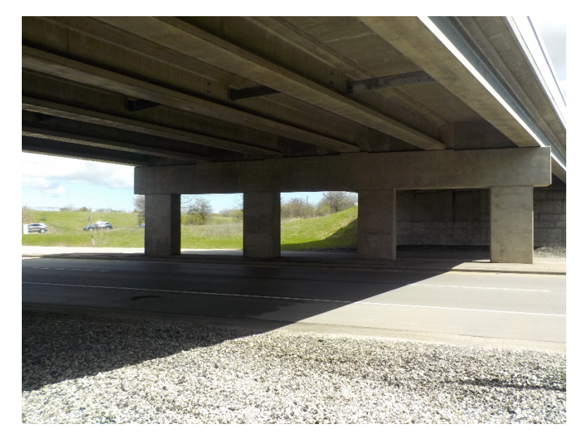
Bridge B-67-325 South Side (Looking Northeast) on STH 164