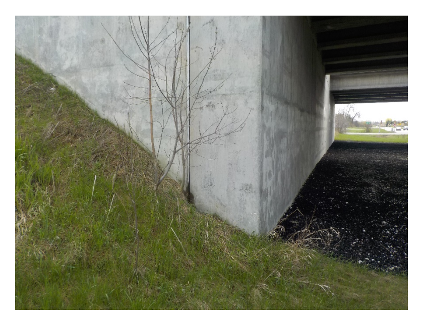
Bridge B-67-325 Bottom of Northeast Wingwall