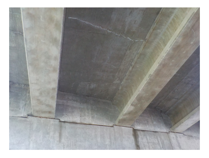
Bridge B-67-325 East Abutment Diaphragm & Bottom of Deck Cracks