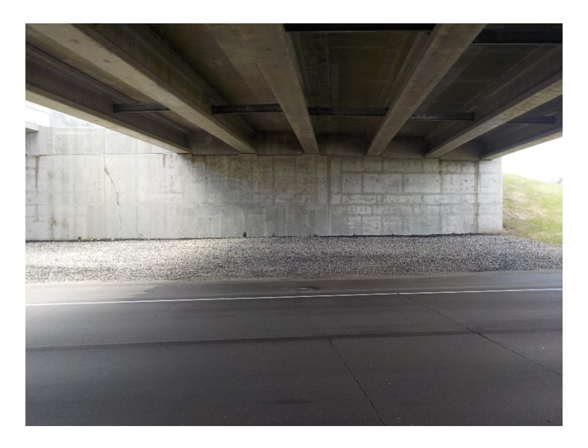
Bridge B-67-325 West Abutment