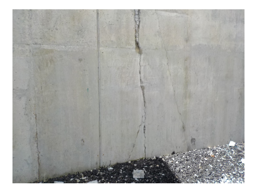
Bridge B-67-325 West Abutment