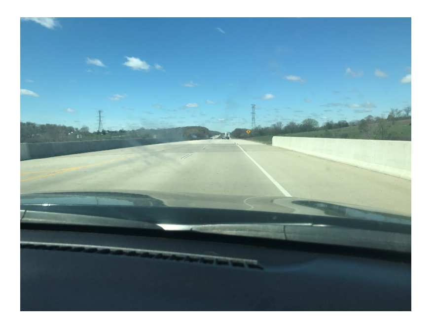
Bridge B-67-325 Top of Deck