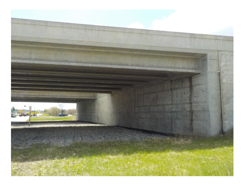
Bridge B-67-325 Northwest Side