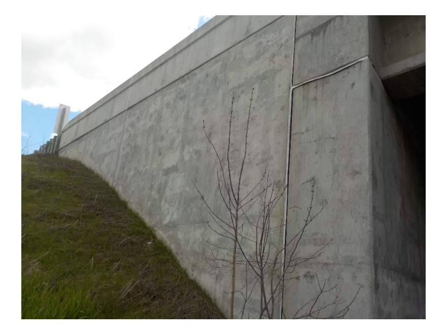
Bridge B-67-325 Northeast Wingwall