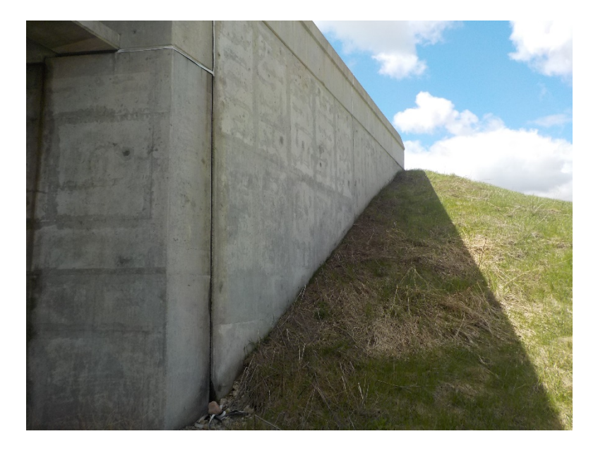
Bridge B-67-325 Northwest Wingwall