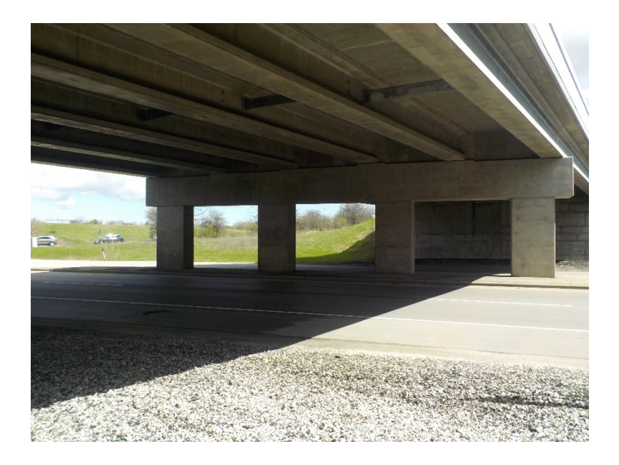
Bridge B-67-325 Looking East Below Bridge