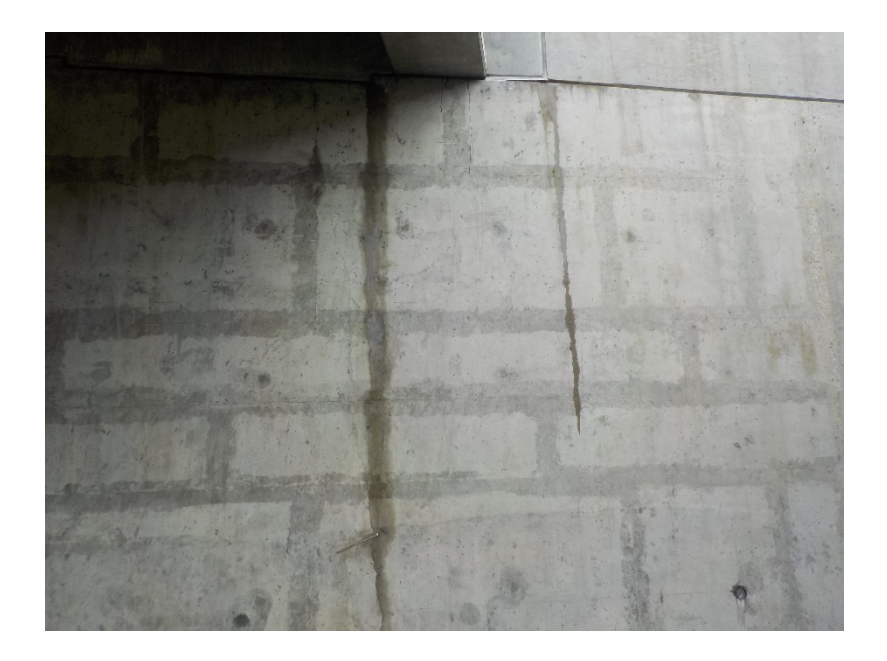
Bridge B-67-325 East Abutment