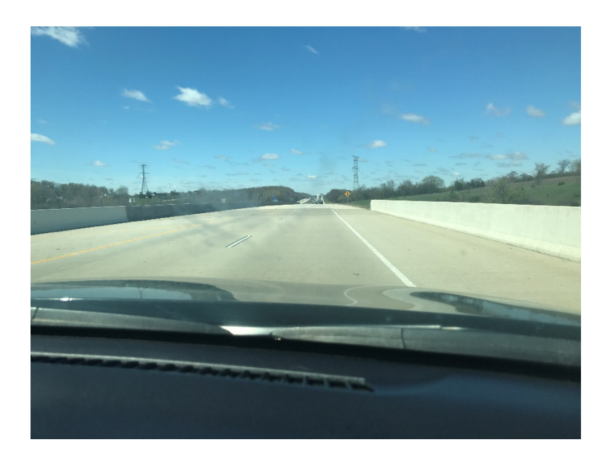
Bridge B-67-325 Top of Deck