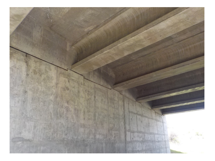
Bridge B-67-325 West Abutment & Superstructure