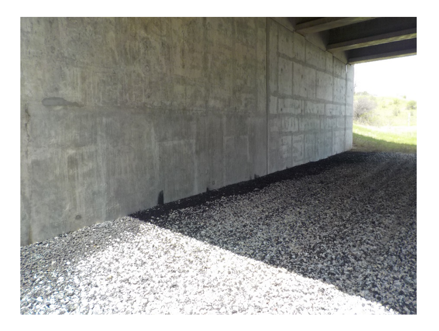
Bridge B-67-325 West Abutment