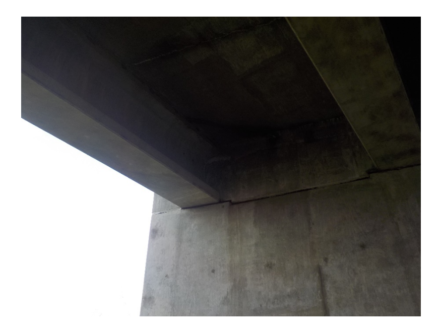
Bridge B-67-325 East Abutment & Superstructure/Diaphragm