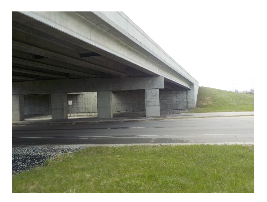
Bridge B-67-325 Northeast Side (Looking West) on STH 164