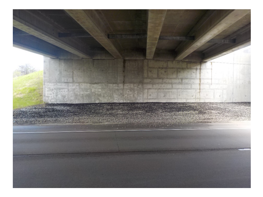
Bridge B-67-325 East Abutment