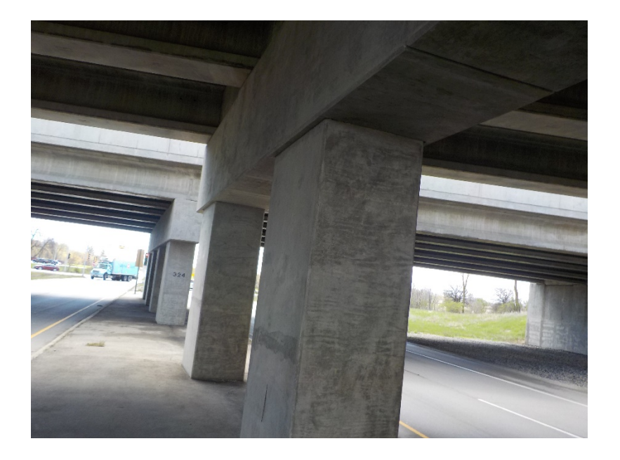
Bridge B-67-325 Pier Column