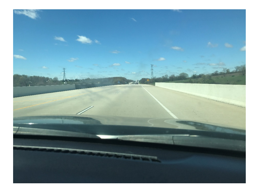
Bridge B-67-325 Top of Deck