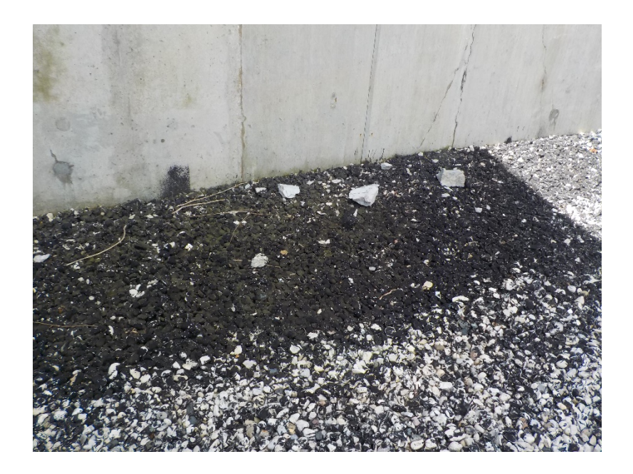
Bridge B-67-325 West Abutment Concrete Debris & Slope Paving