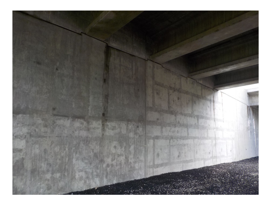
Bridge B-67-325 East Abutment