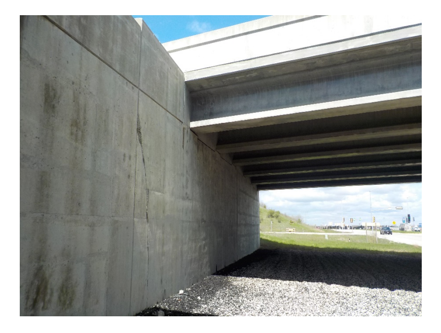
Bridge B-67-325 West Abutment