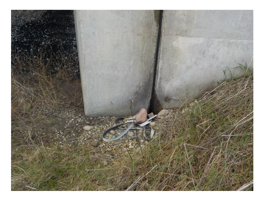
Bridge B-67-325 Bottom of Southwest Wingwall