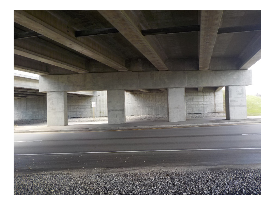
Bridge B-67-325 Looking West Below Bridge