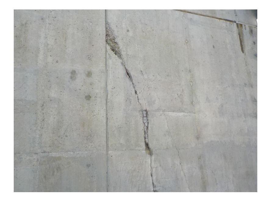
Bridge B-67-325 West Abutment