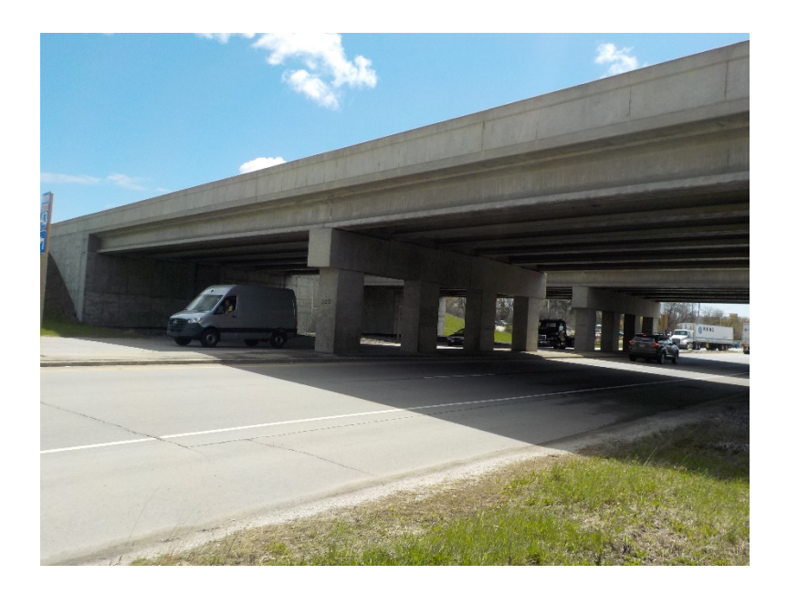
Bridge B-67-325 North Side (Looking South) on STH 164