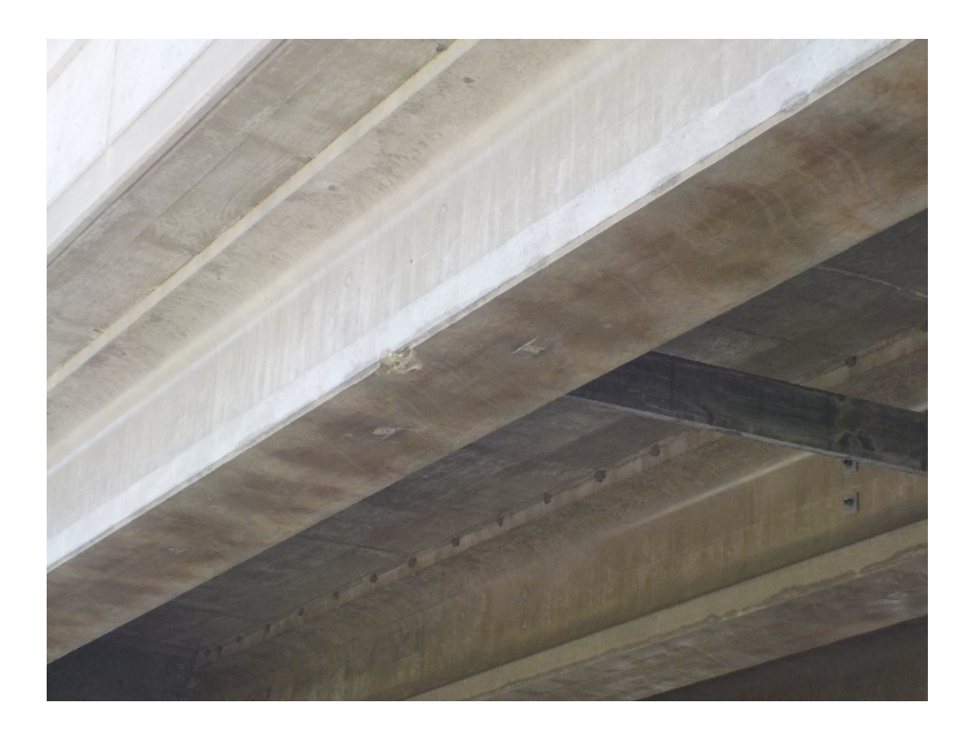
Bridge B-67-325 Exterior Girder Bottom Flange Damage