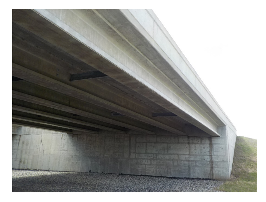
Bridge B-67-325 Northwest Side (Looking Southwest)