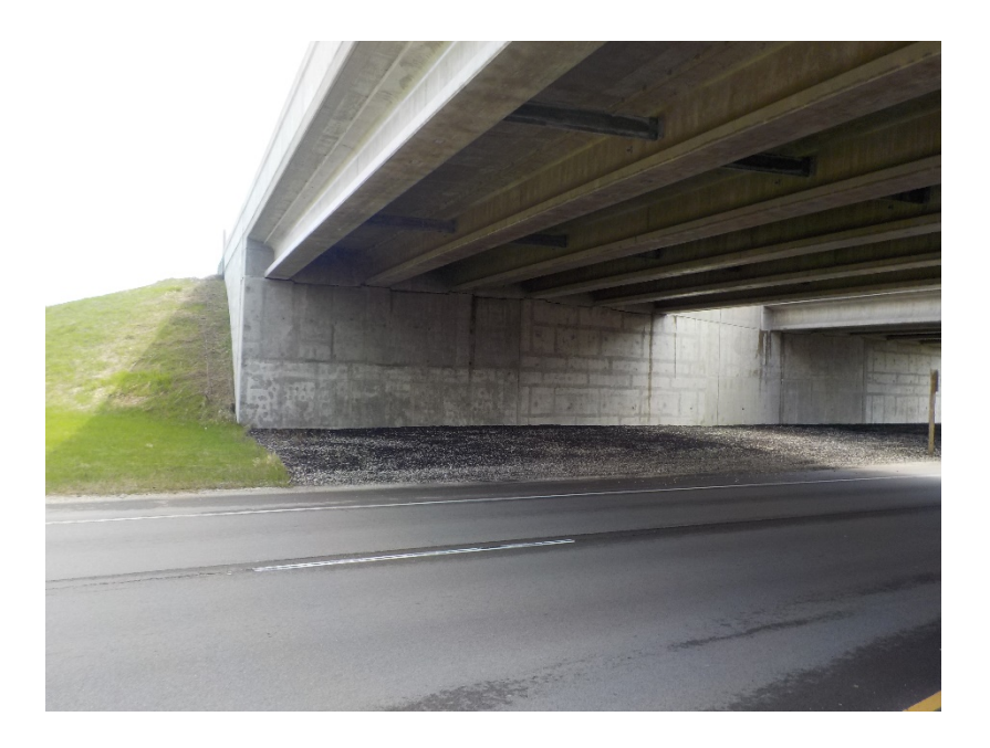
Bridge B-67-325 Northeast Side (Looking East)