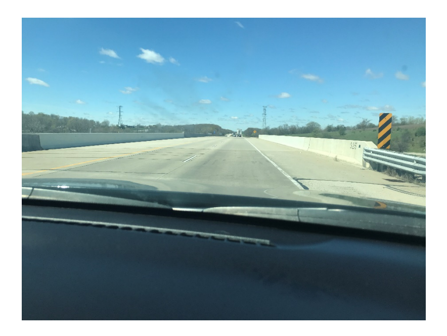
Bridge B-67-325 Top of Deck