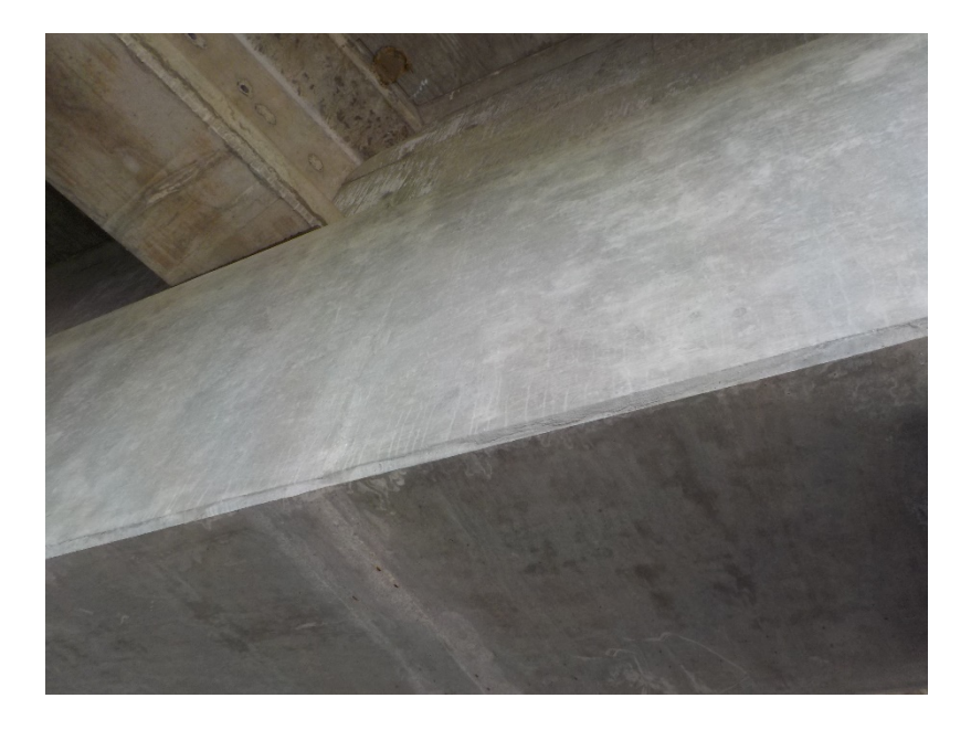
Bridge B-67-325 Pier Cap & Diaphragm