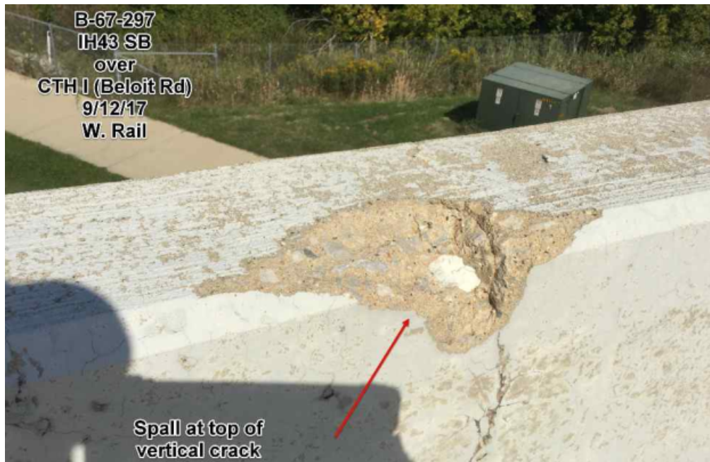
West Rail, Spalls.