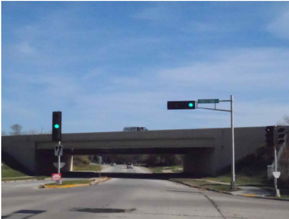
North elevation, looking south.