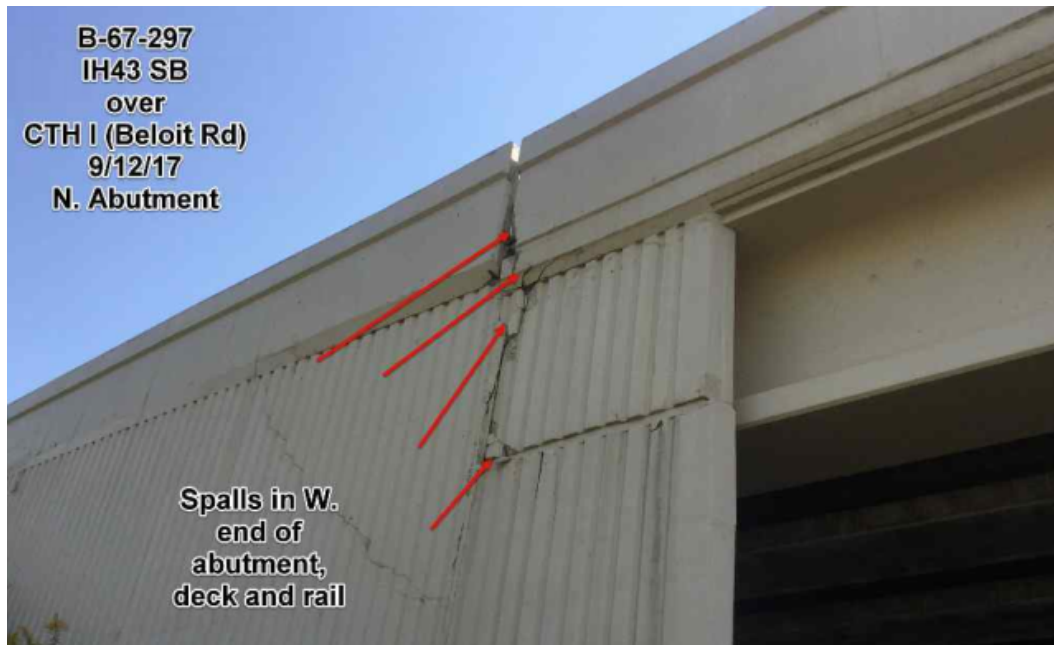
North abutment, looking east.