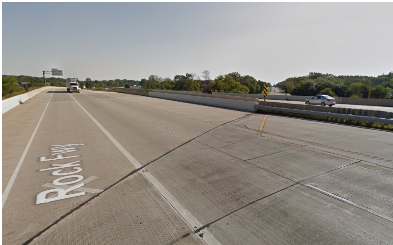
Wearing surface at west, looking north.