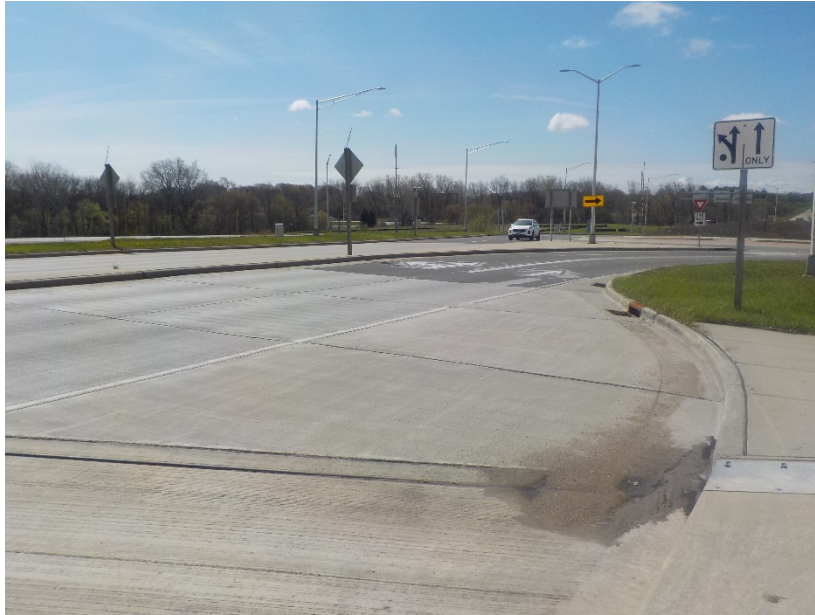
Bridge B-67-113 South Side (Looking South) Roundabout