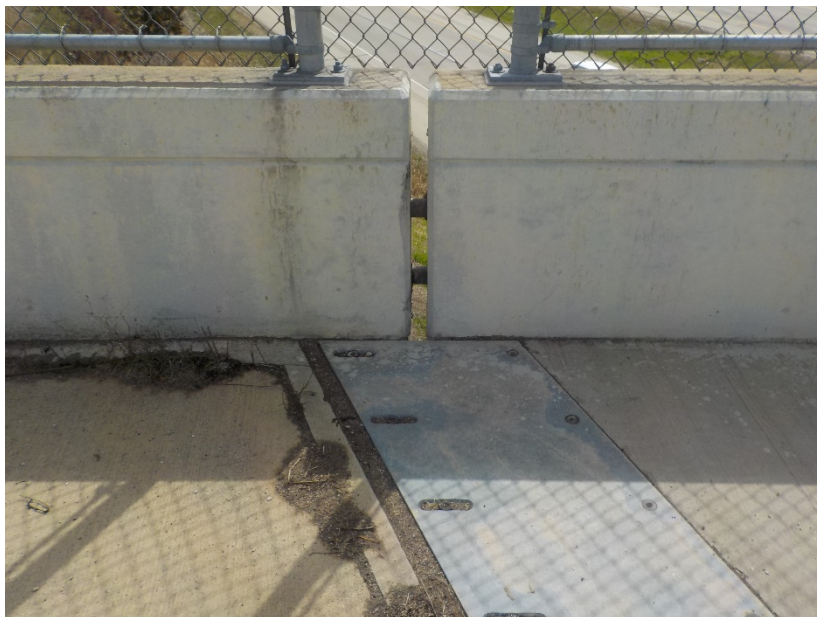
Bridge B-67-113 East Parapet Conduits (2 Conduits in Parapet)