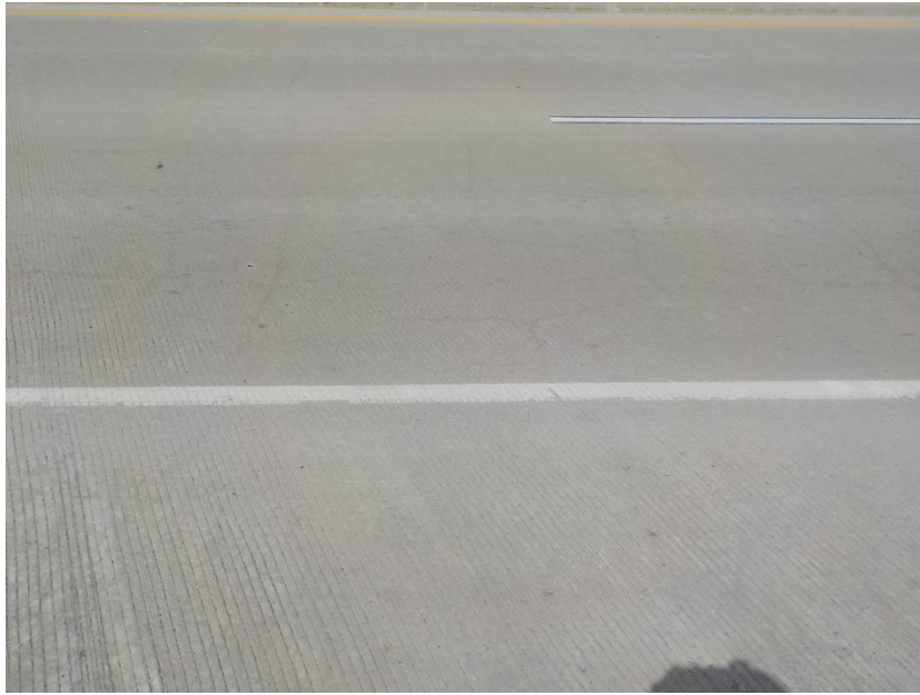
Bridge B-67-113 Top of Deck