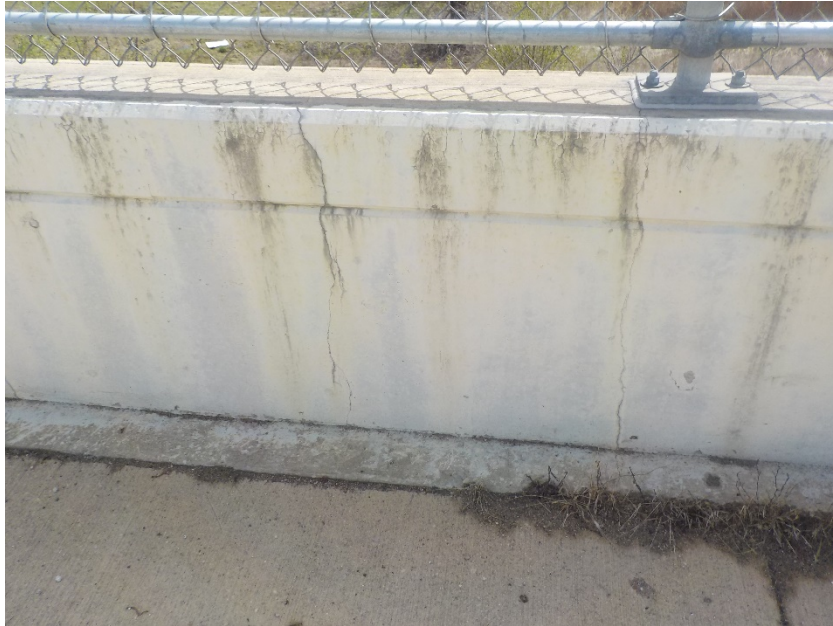
Bridge B-67-113 Parapet Cracking