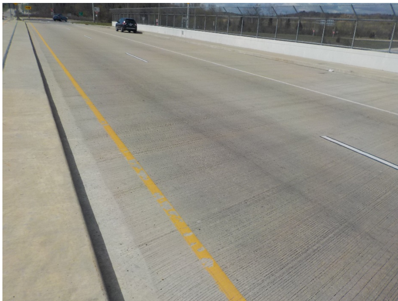
Bridge B-67-113 Top of Deck