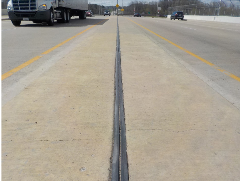
Bridge B-67-113 Top of Median