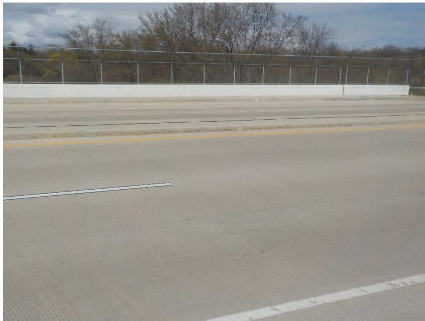
Bridge B-67-113 Looking West