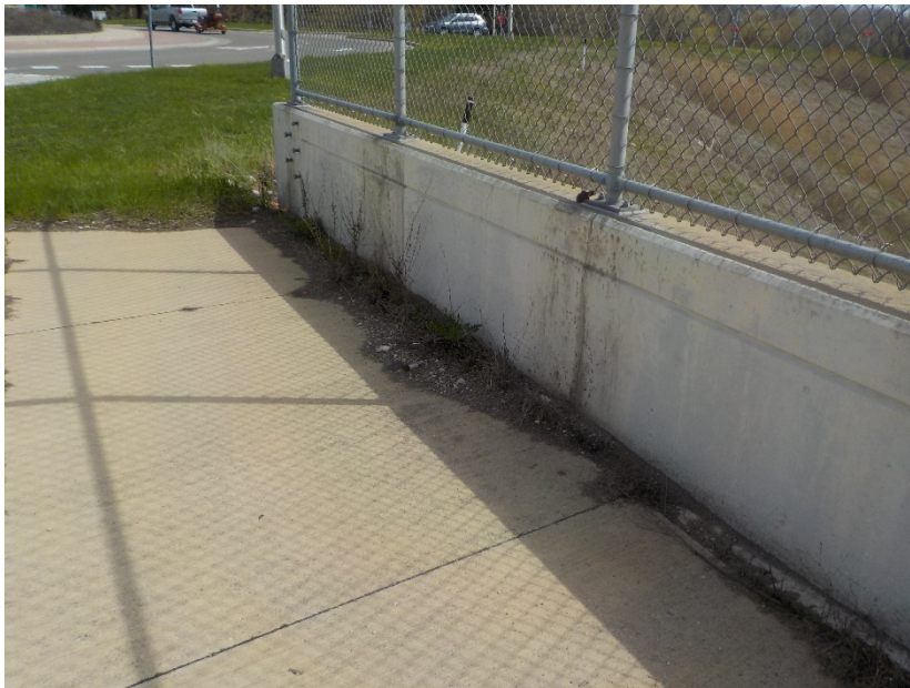
Bridge B-67-113 Parapet Cracking