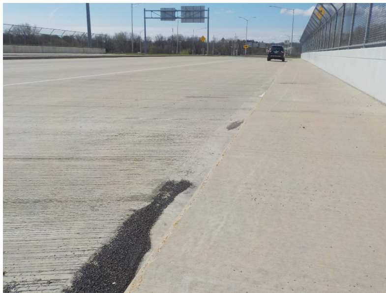
Bridge B-67-113 North Side (Looking South) on CTH Y