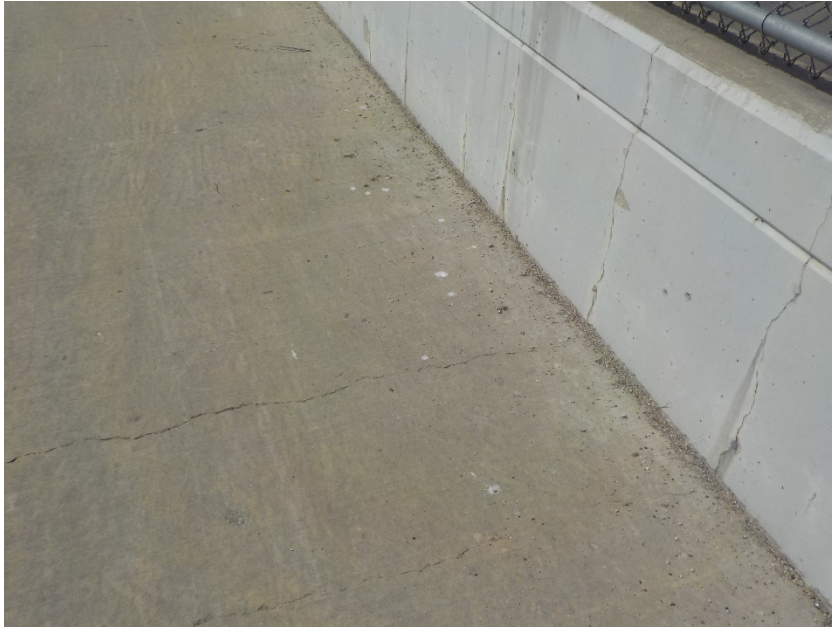
Bridge B-67-113 Sidewalk Cracking