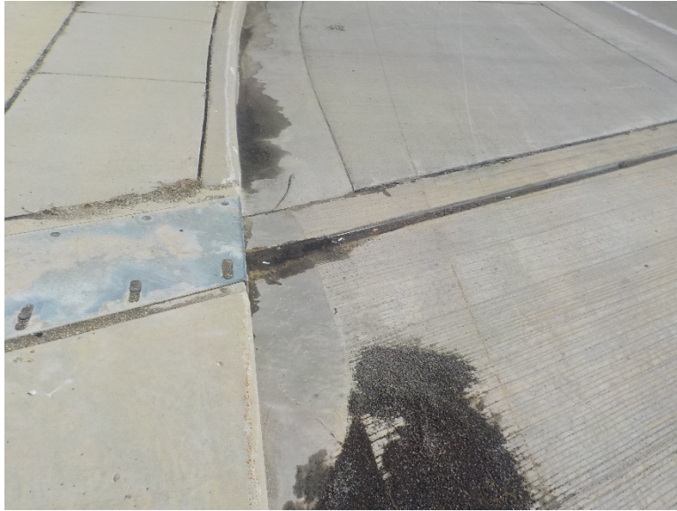
Bridge B-67-113 Northwest Approach and Paving Block/Expansion Joint