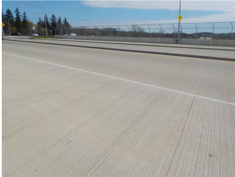
Bridge B-67-113 Looking East