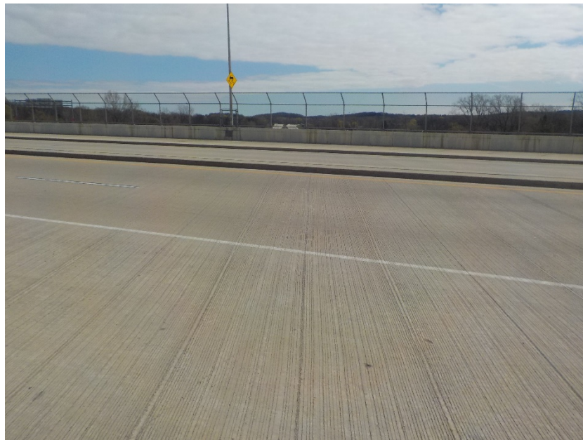
Bridge B-67-113 Looking East