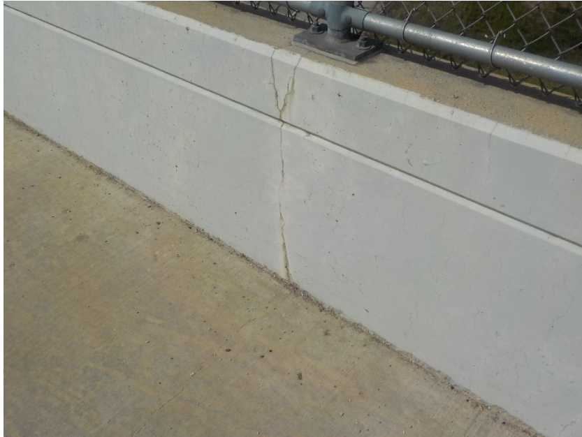
Bridge B-67-113 Parapet Cracking