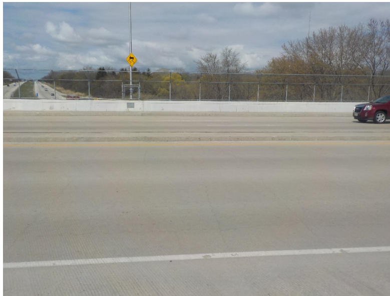
Bridge B-67-113 Looking West