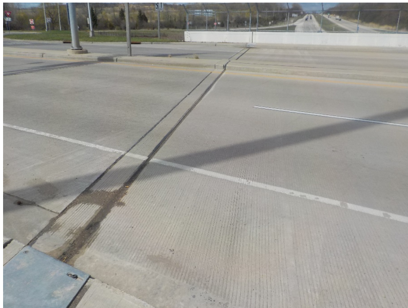
Bridge B-67-113 South Approach and Paving Block/Expansion Joint