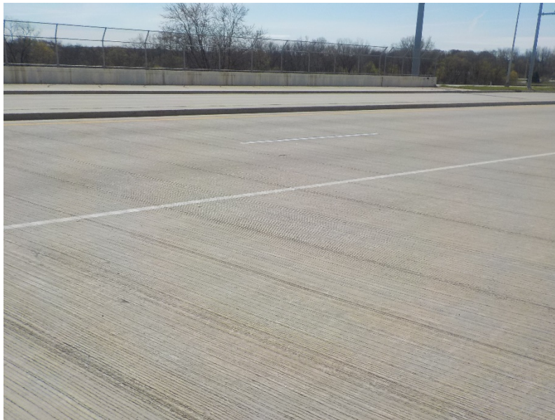
Bridge B-67-113 Top of Deck