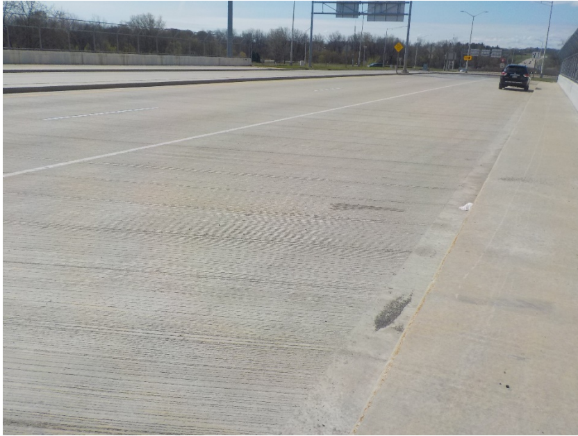
Bridge B-67-113 Top of Deck