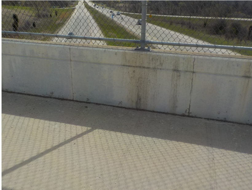
Bridge B-67-113 Parapet Cracking