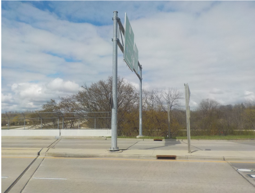
Bridge B-67-113 North Side Sign Structure