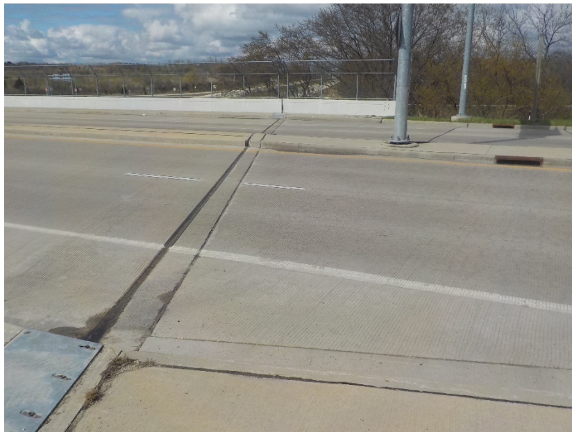
Bridge B-67-113 North Approach and Paving Block/Expansion Joint