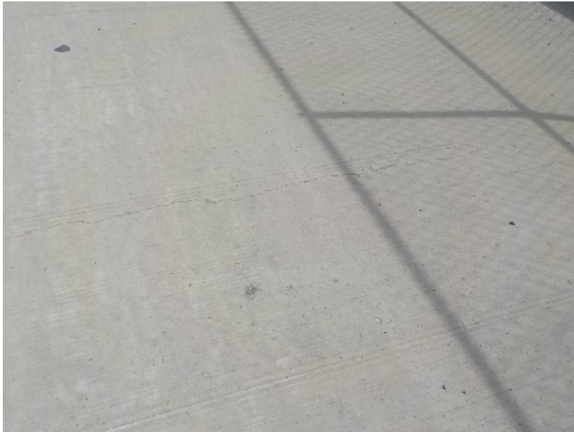
Bridge B-67-113 Sidewalk Cracking