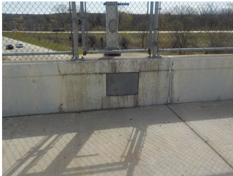
Bridge B-67-113 East Parapet Light Blister and Junction Box