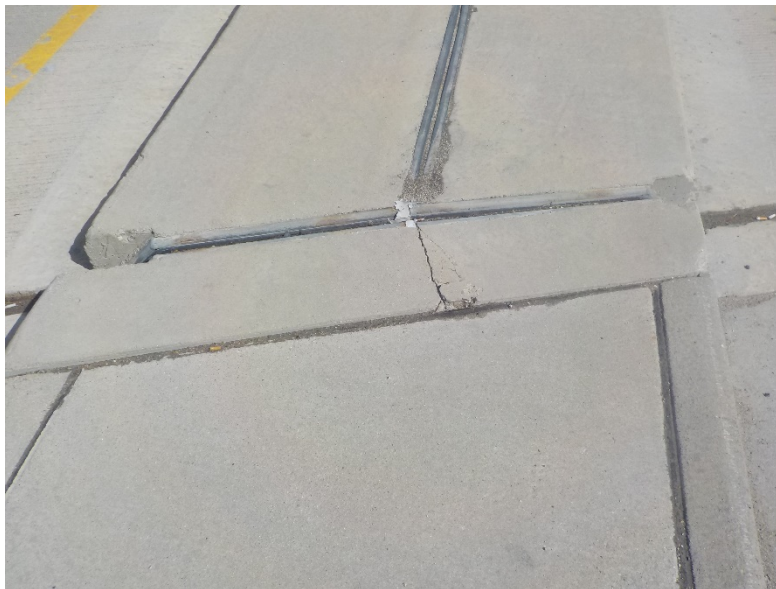
Bridge B-67-113 Crack in South Median/Paving Block