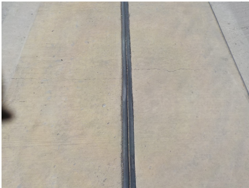
Bridge B-67-113 Top of Median