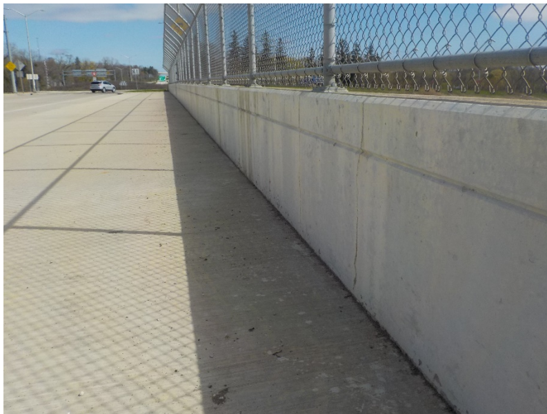
Bridge B-67-113 Parapet Cracking