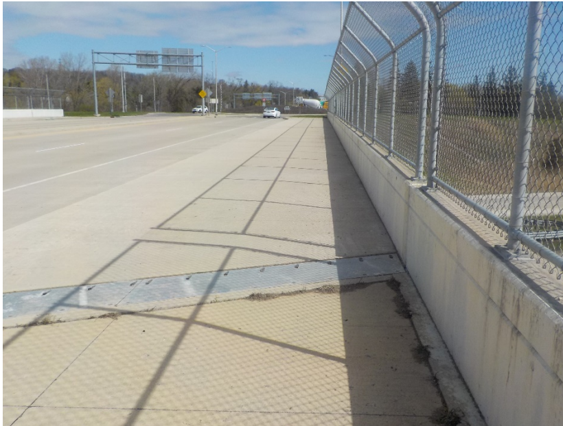
Bridge B-67-113 South Side (Looking North) on CTH Y