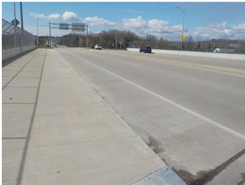
Bridge B-67-113 North Side (Looking South) on CTH Y