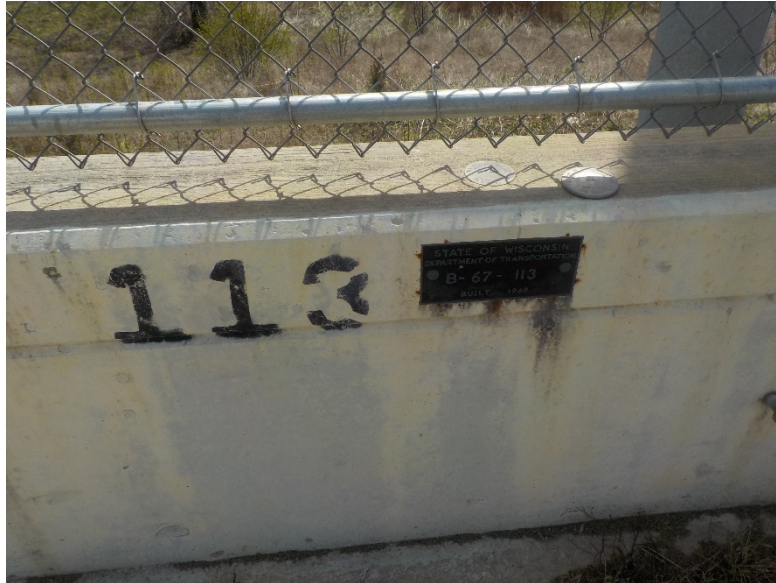
Bridge B-67-113 Name Plate, Benchmark and Parapet