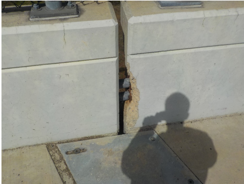
Bridge B-67-113 West Parapet Spall (2-Conduits in Parapet)