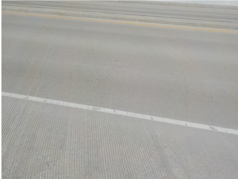
Bridge B-67-113 Top of Deck