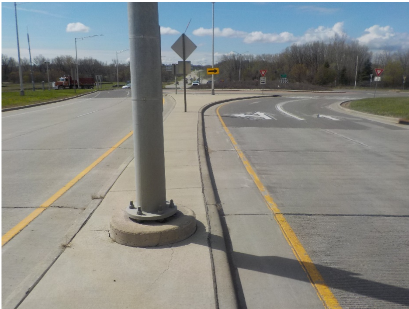
Bridge B-67-113 South Side (Looking South)