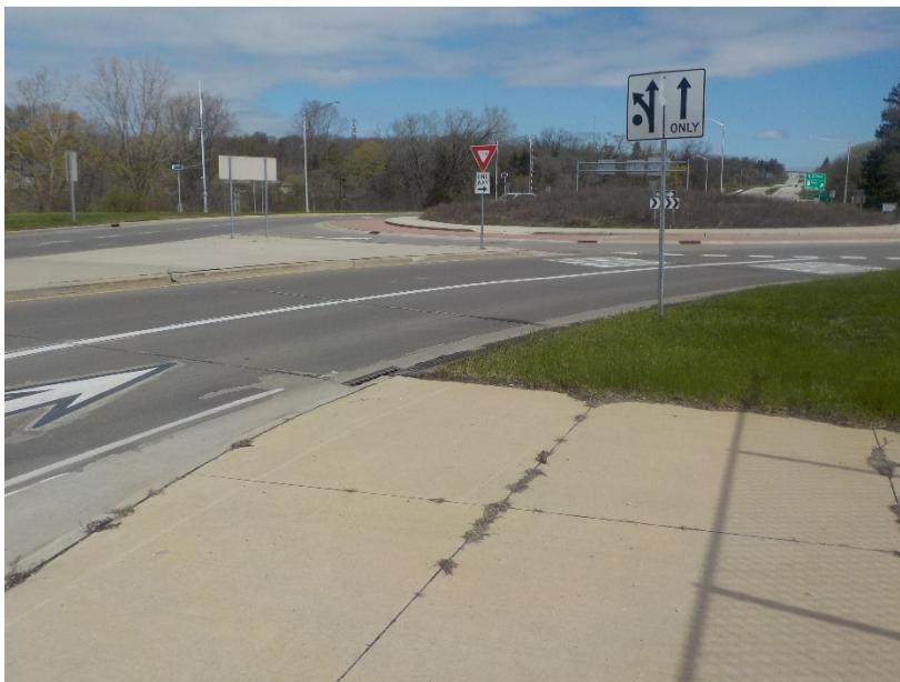
Bridge B-67-113 North Side (Looking North) Roundabout