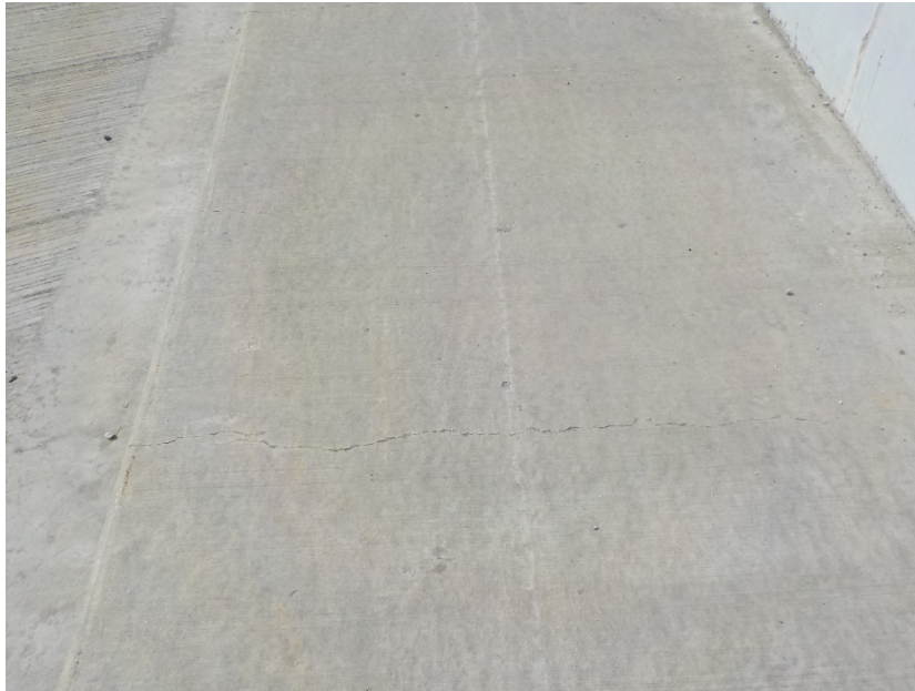
Bridge B-67-113 Sidewalk Cracking