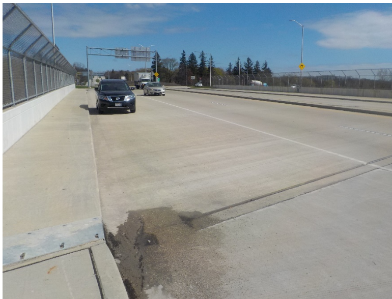
Bridge B-67-113 South Side (Looking North) on CTH Y