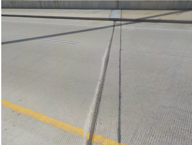
Bridge B-67-113 South Approach and Paving Block/Expansion Joint