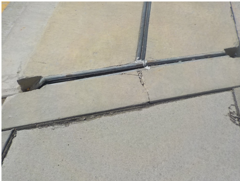
Bridge B-67-113 Crack in North Median/Paving Block