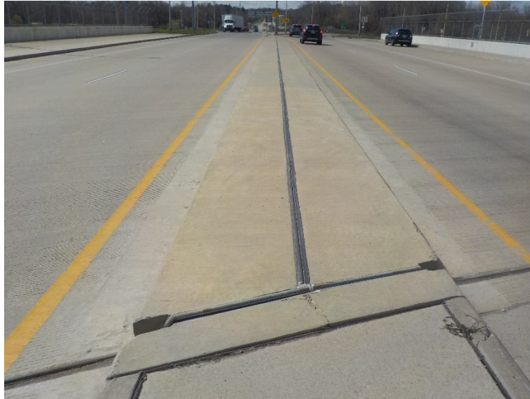
Bridge B-67-113 North Side (Looking South) on CTH Y