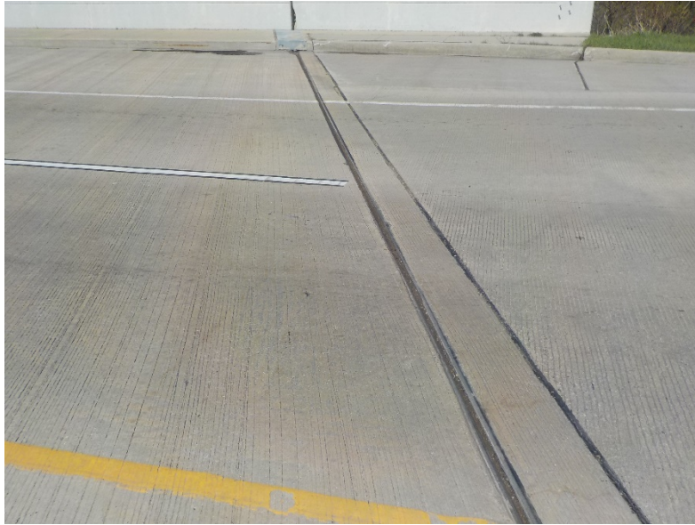
Bridge B-67-113 North Approach and Paving Block/Expansion Joint