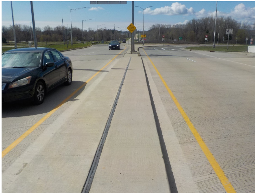
Bridge B-67-113 Looking South at Roundabout and Sign Structure