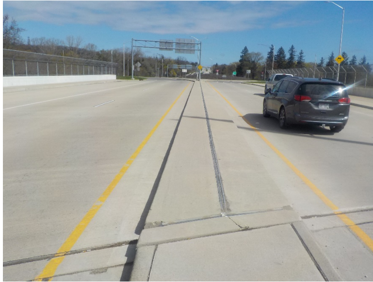
Bridge B-67-113 South Side (Looking North) on CTH Y