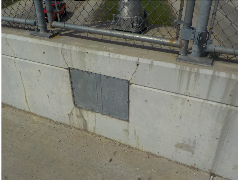
Bridge B-67-113 West Parapet Light Blister and Junction Box