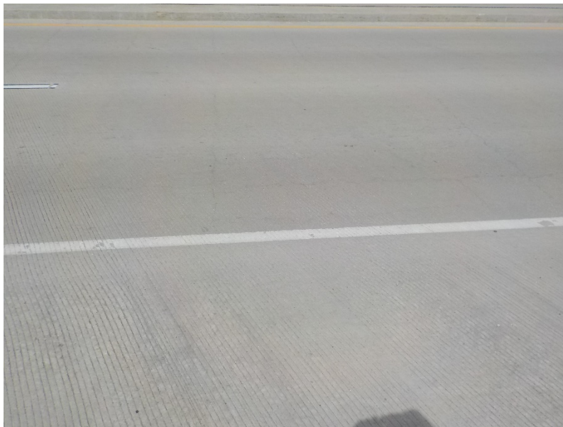
Bridge B-67-113 Top of Deck