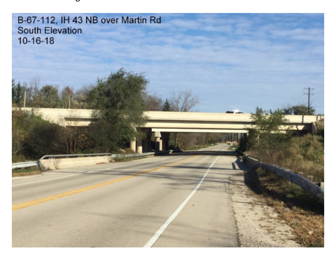
South elevation, looking north.