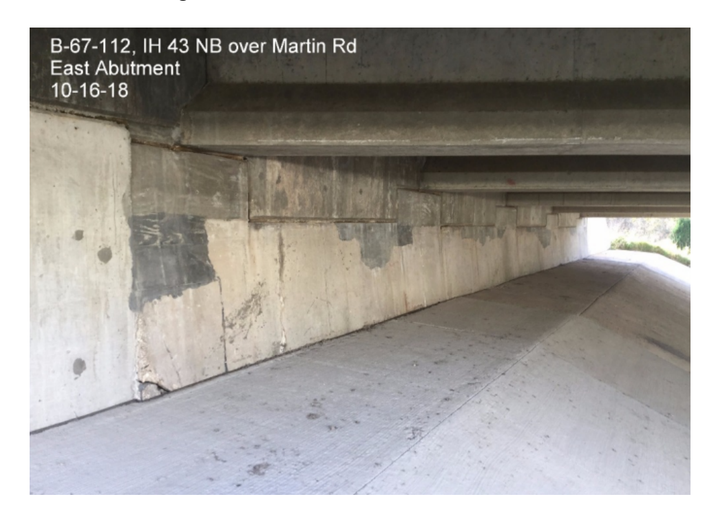
East Abutment & Slope.