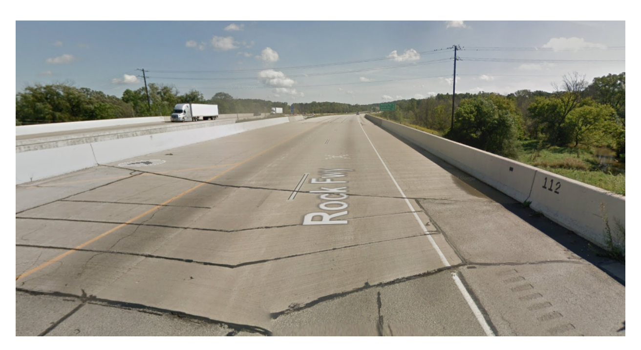
Overview of top of deck, looking east.