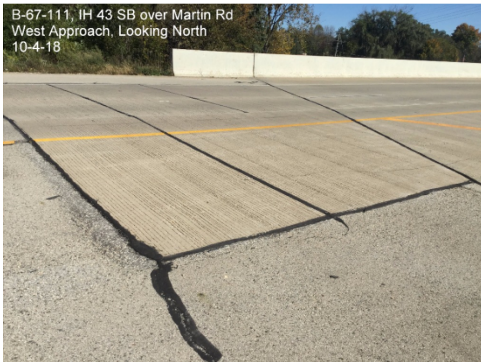
West approach, looking north and west side of deck.