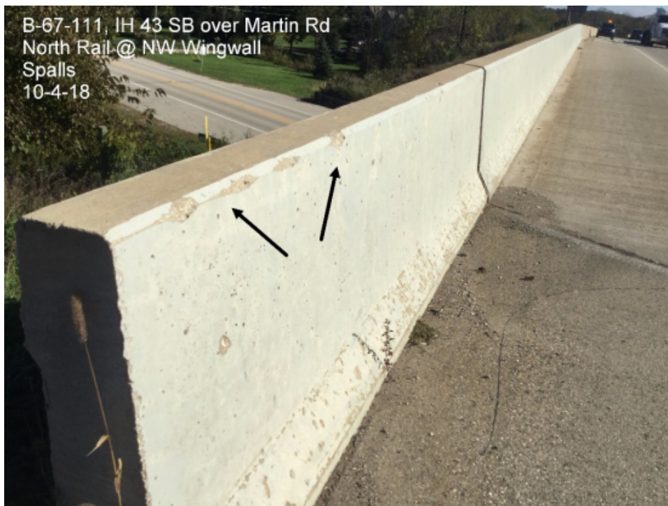
North Rail at NW Wingwall, Spalls. Photo from WisDOT inspection report.