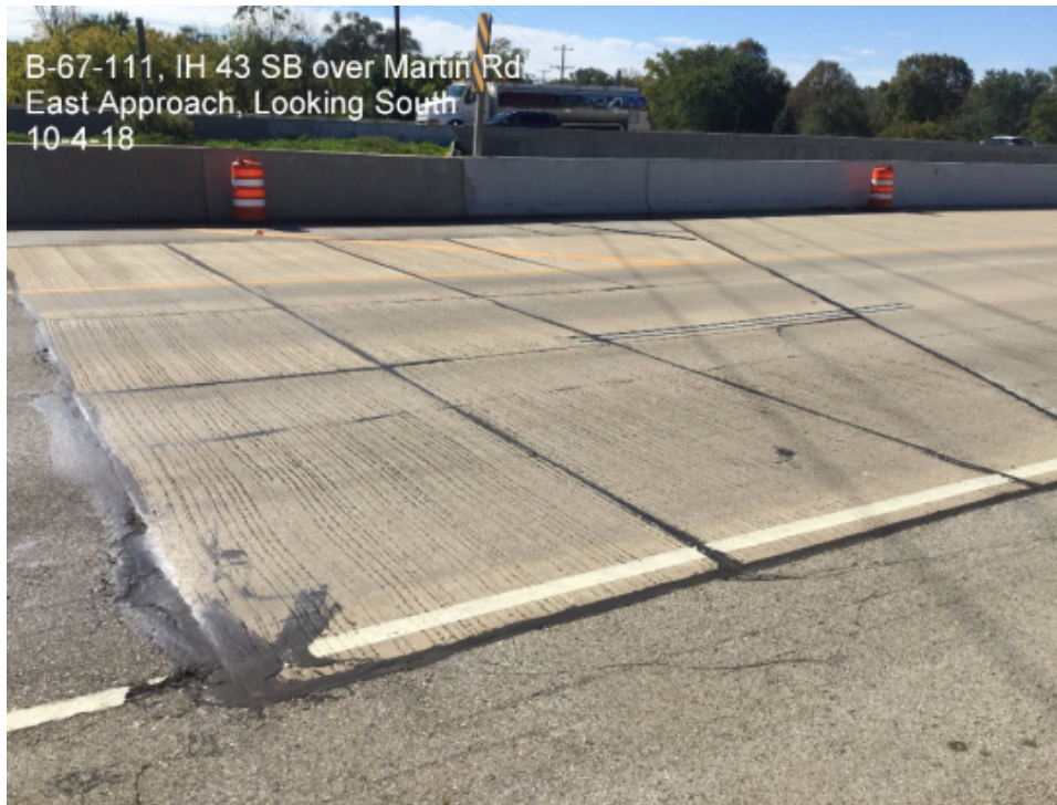
East approach, Looking south and east side of deck.