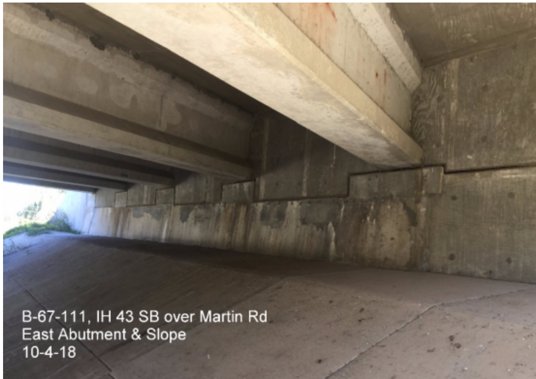
East Abutment & Slope.