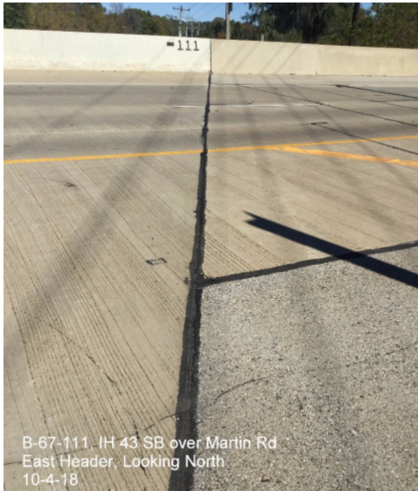
East header, looking north.