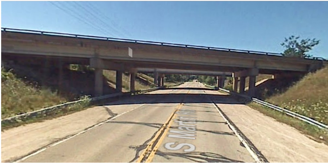
North elevation, looking south.