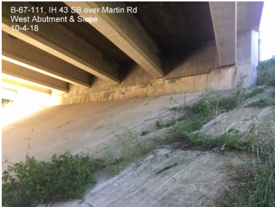
West abutment & slope. Photo from WisDOT inspection report.