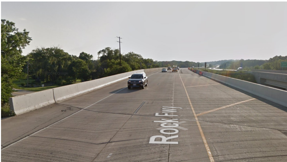
Overview of top of deck, looking east.