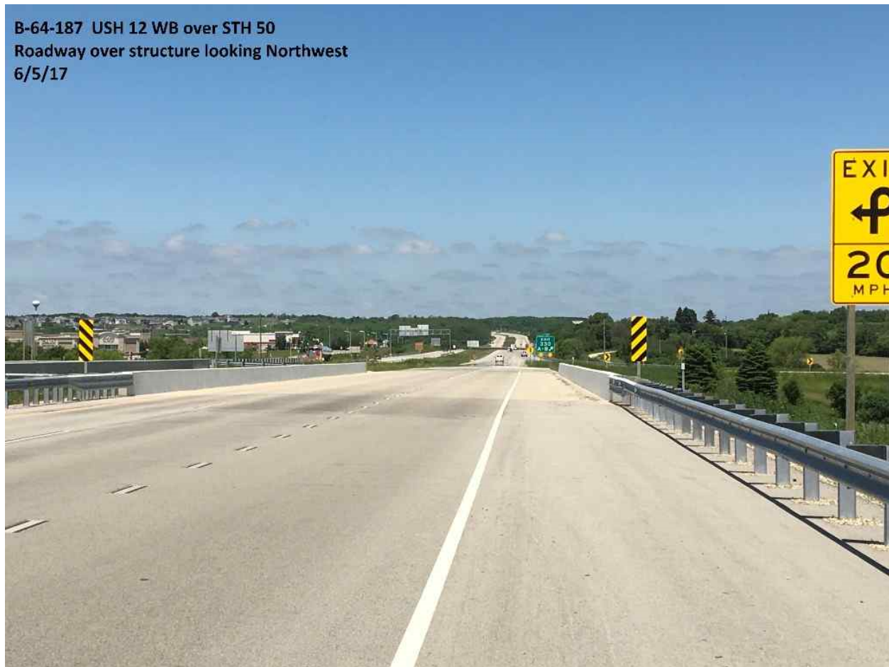
B-64-187, Top of deck, looking northwest