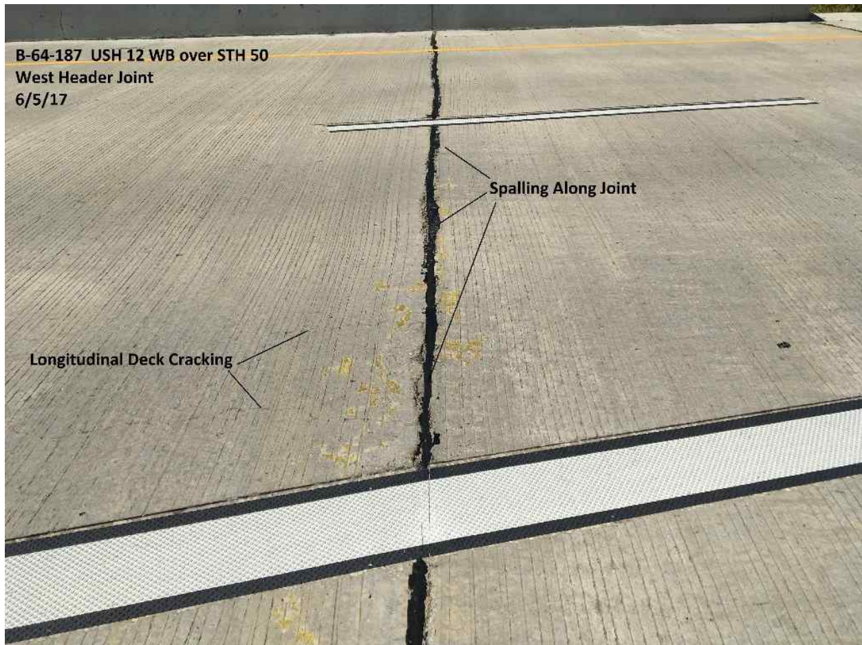
B-64-187, West deck joint