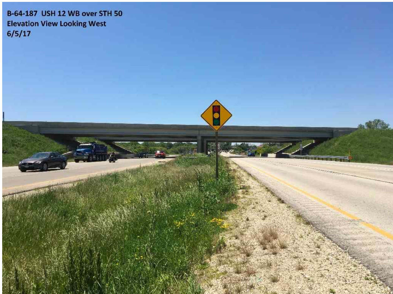
B-64-187, East elevation