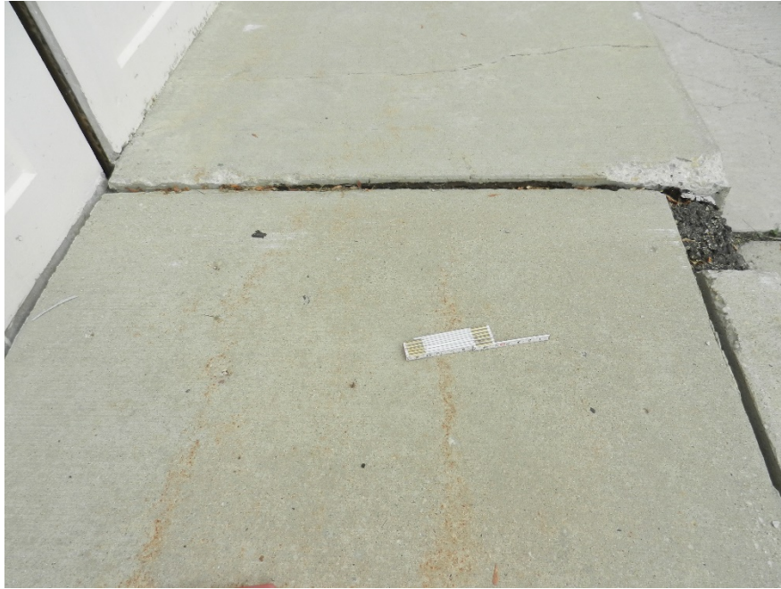
Bridge B-40-377 SW Corner Approach Sidewalk