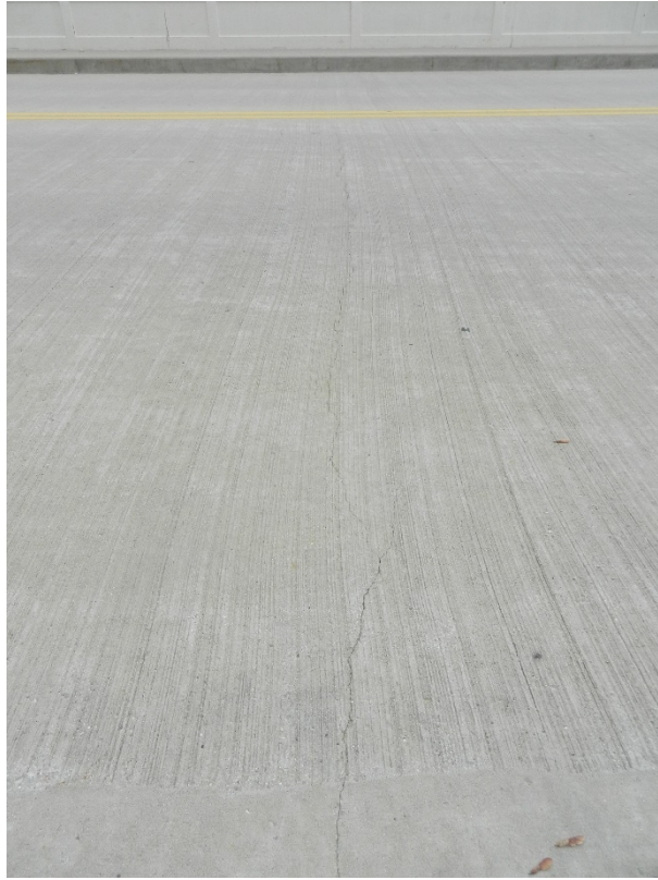
Bridge B-40-377 Deck Cracks