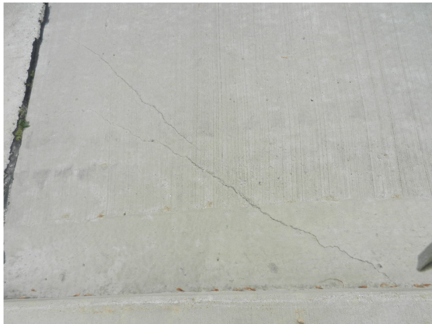
Bridge B-40-377 Deck Cracks