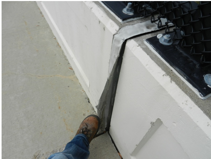
Bridge B-40-377 NE Corner Bridge/Approach Parapet Joint (Loose Caulk)