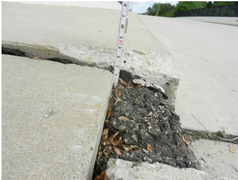
Bridge B-40-377 SW Corner Approach Curb