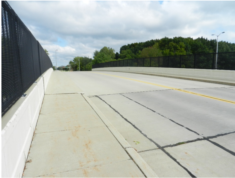
Bridge B-40-377 South Side (Looking North) on 116 th Street