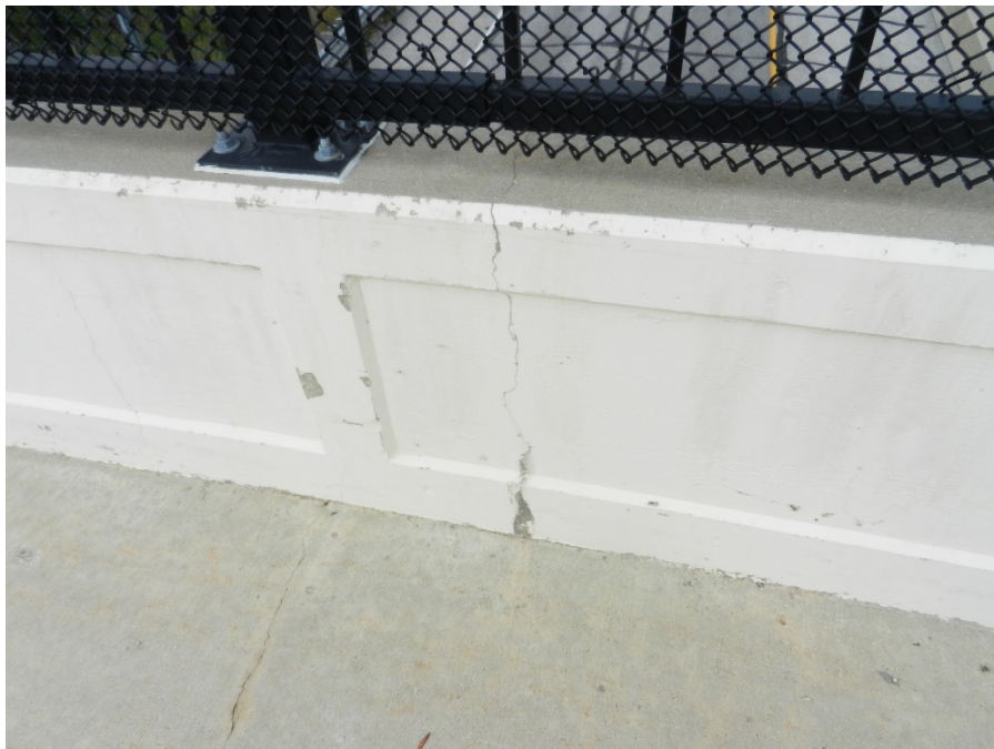
Bridge B-40-377 Parapet Cracks & Scaling