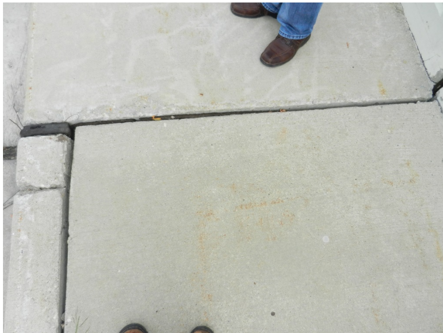
Bridge B-40-377 SE Corner Approach Sidewalk