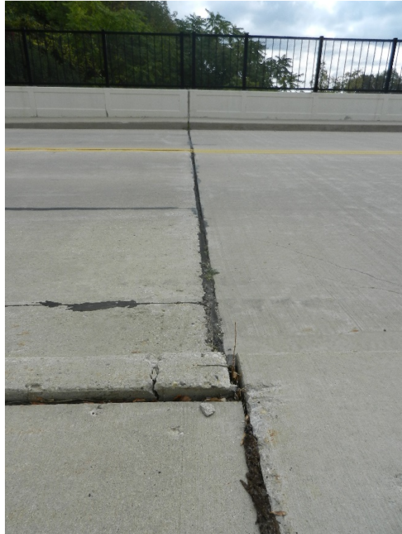
Bridge B-40-377 North Approach Joint