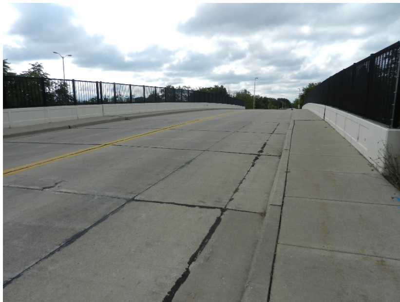
Bridge B-40-377 North Side (Looking South) on 116 th Street