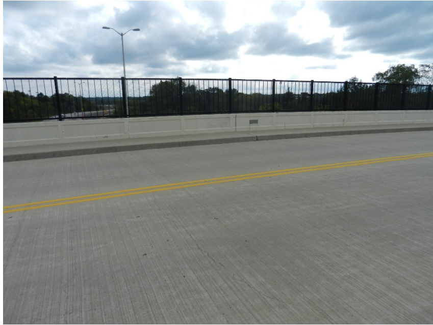
Bridge B-40-377 Looking East