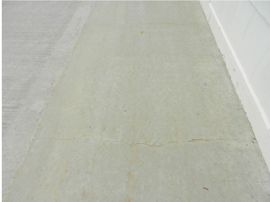
Bridge B-40-377 Sidewalk Cracks