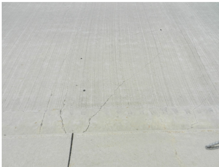
Bridge B-40-377 Deck Cracks