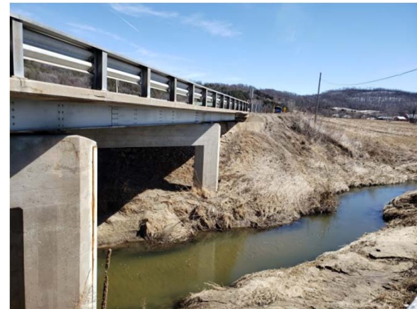
North side of bridge looking east