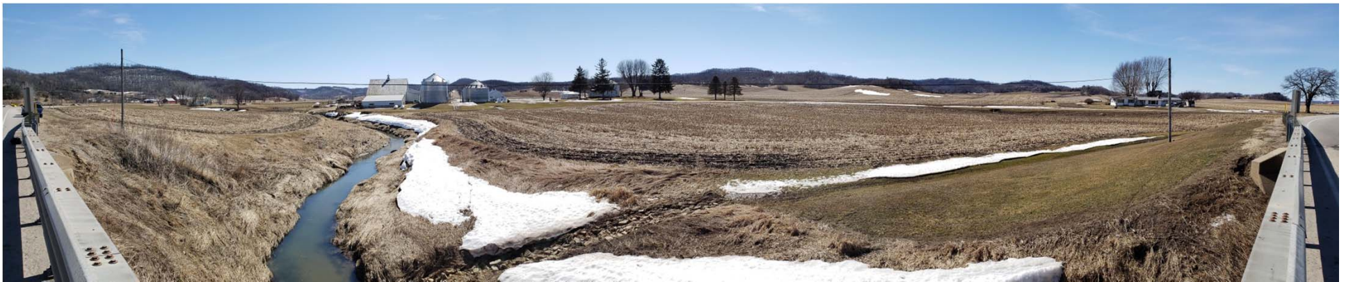
Dutch Creek looking south