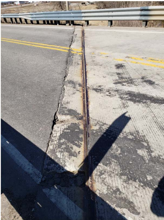
North Abutment - Joint Looking East