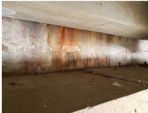
South Abutment - Surface Repair