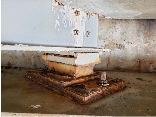
South Abutment - Bearing 3E