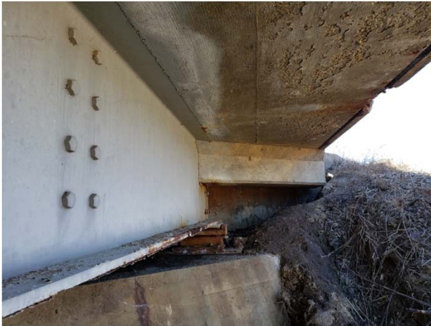
North Abutment - Girder 1E