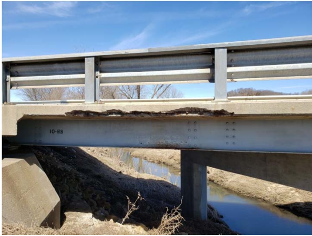
North Abutment - West Drip Edge