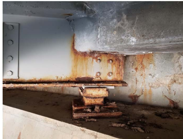
North Abutment – Bearing 3E (Typ)