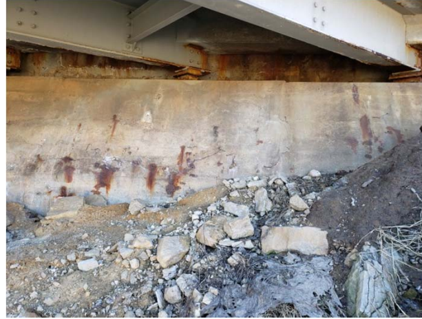
North Abutment - Overview