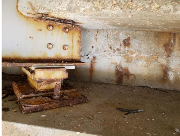
South Abutment - Bearing 4E