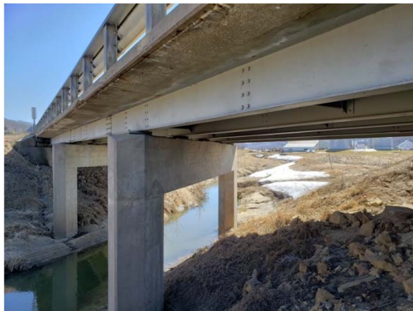
North side of bridge looking west