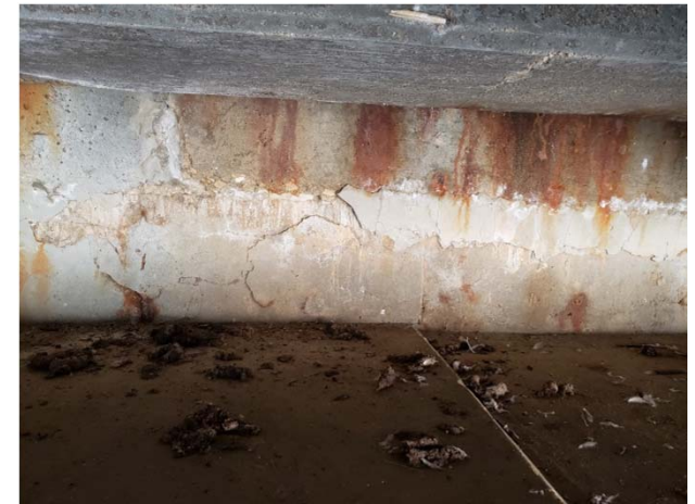
North Abutment Surface Repair