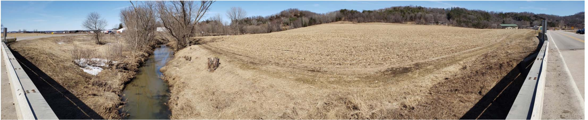
Dutch Creek looking north