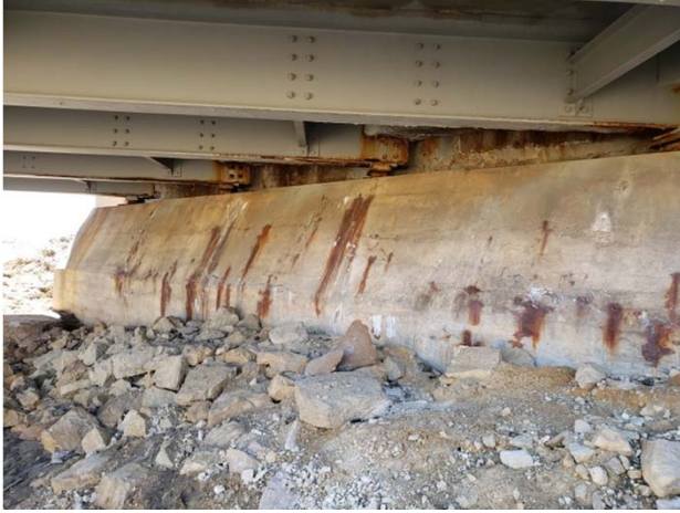
North Abutment - Overview