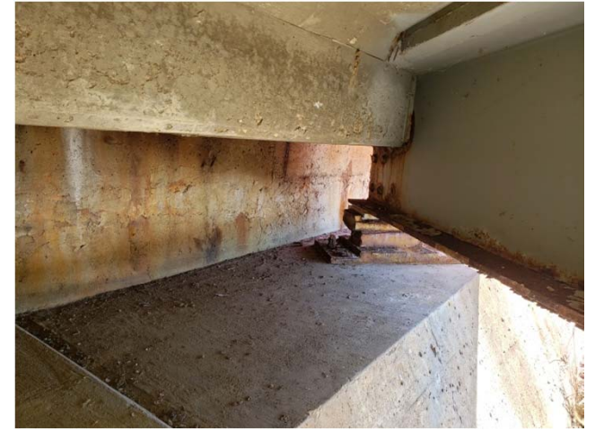
South Abutment - Girder 4E