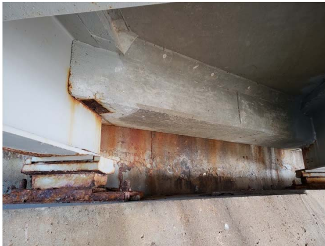
South Abutment - Bearing 1E