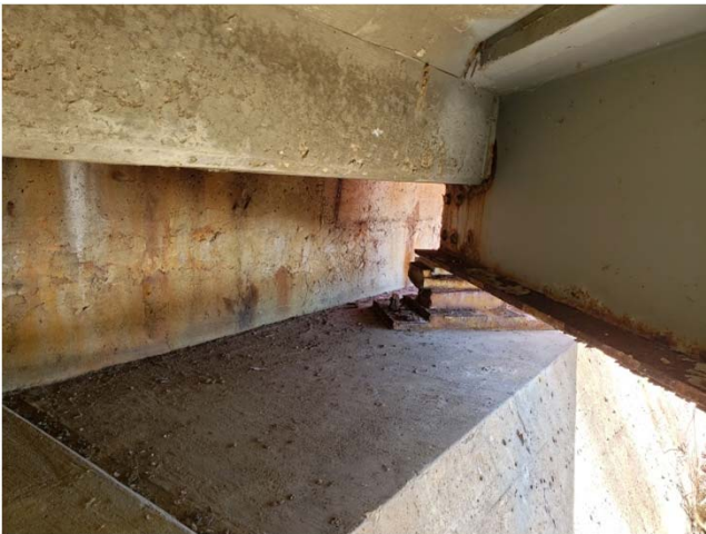
East Abutment - Girder 4E