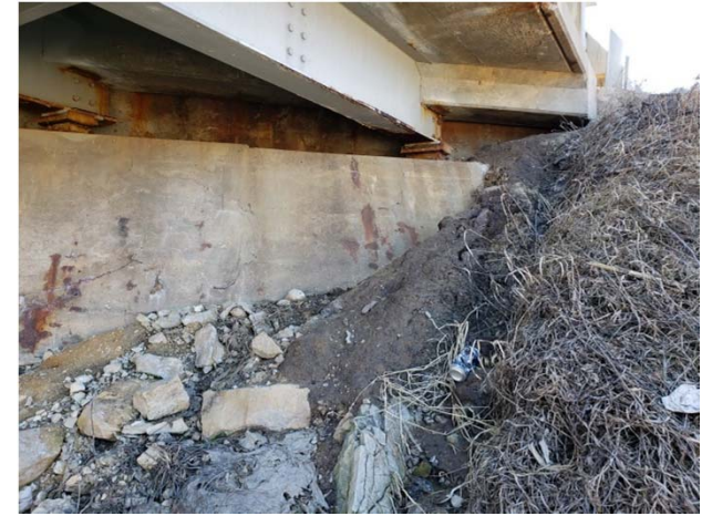
North Abutment - Overview