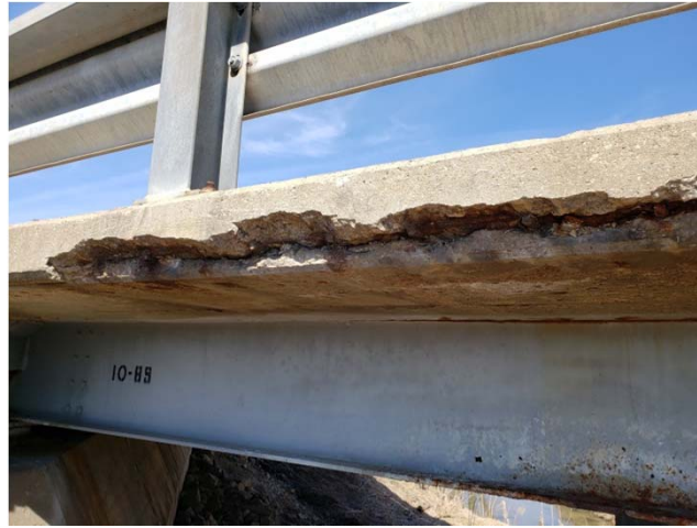
North Abutment - West Drip Edge