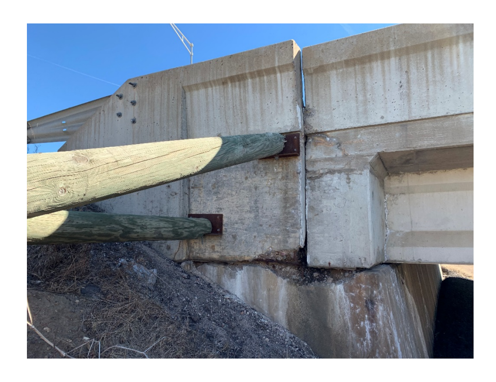
NW WING TIMBER SUPPORTS