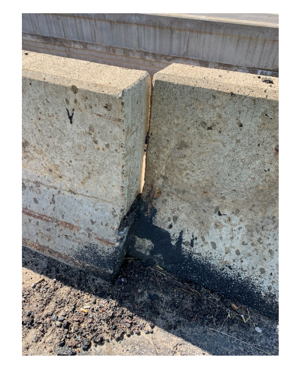
NW WING TIPPING