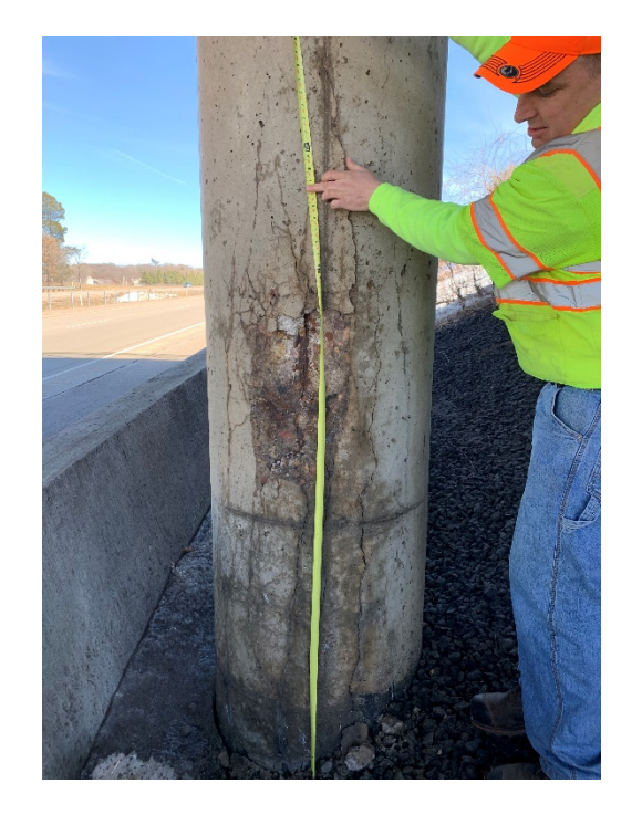
PIER 1 COLUMN