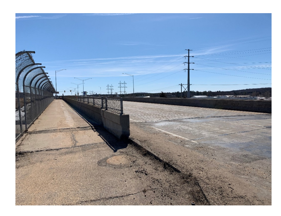
NORTH APPROACH – LOOKING SOUTH