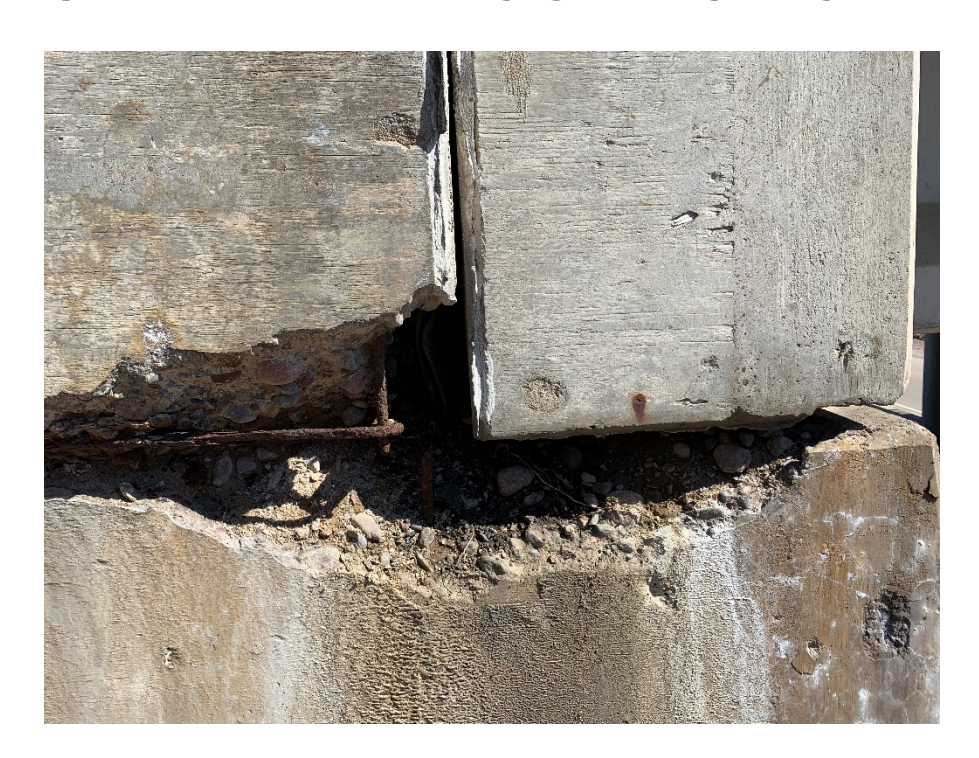
NW WING DETERIORATION