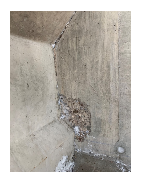
SOUTH ABUTMENT BACKWALL