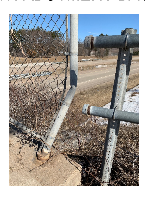
SE QUAD FENCE