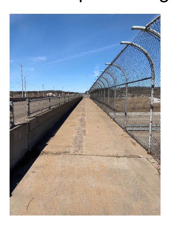
SIDEWALK – LOOKING NORTH