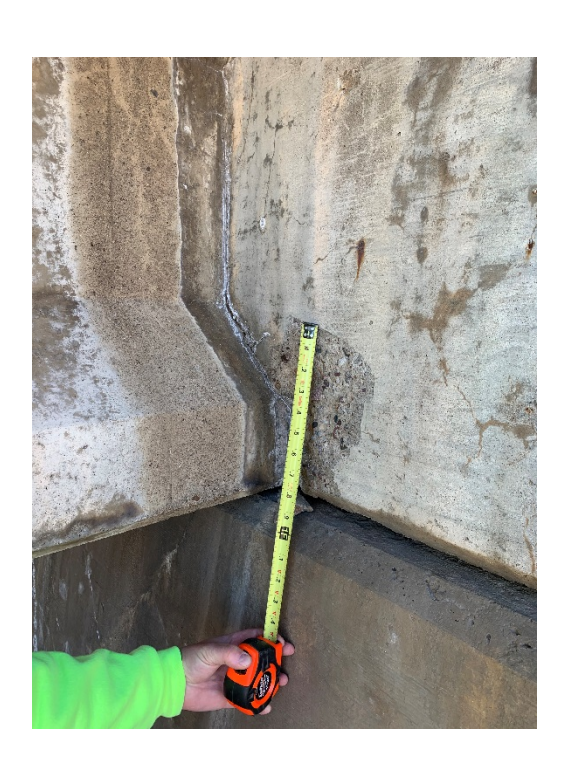
NORTH ABUTMENT BACKWALL