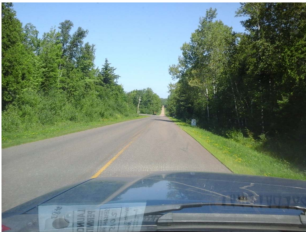
Figure 3- Little Sand Bay Road Looking North