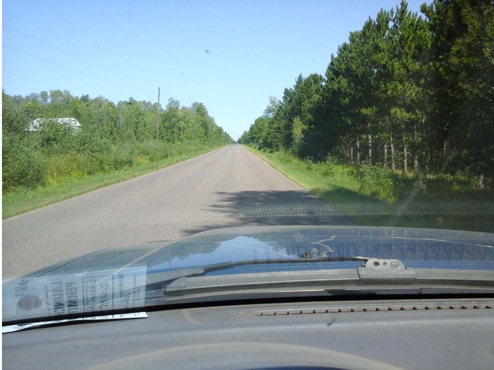
Figure 1- Little Sand Bay Road Looking North