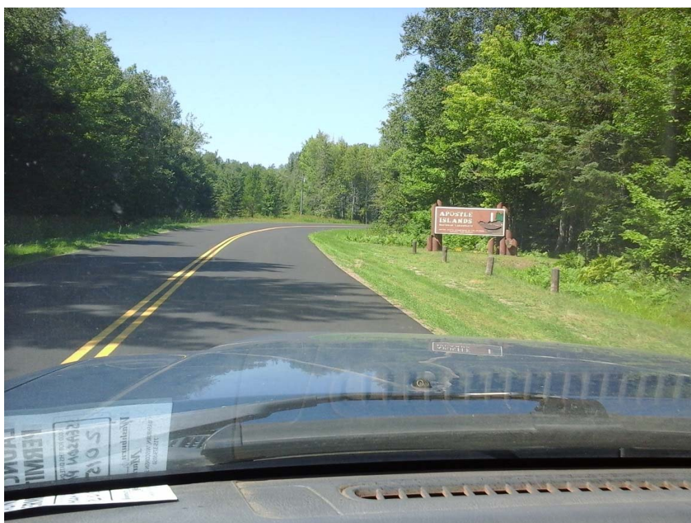
Figure 4- Little Sand Bay Road Looking West