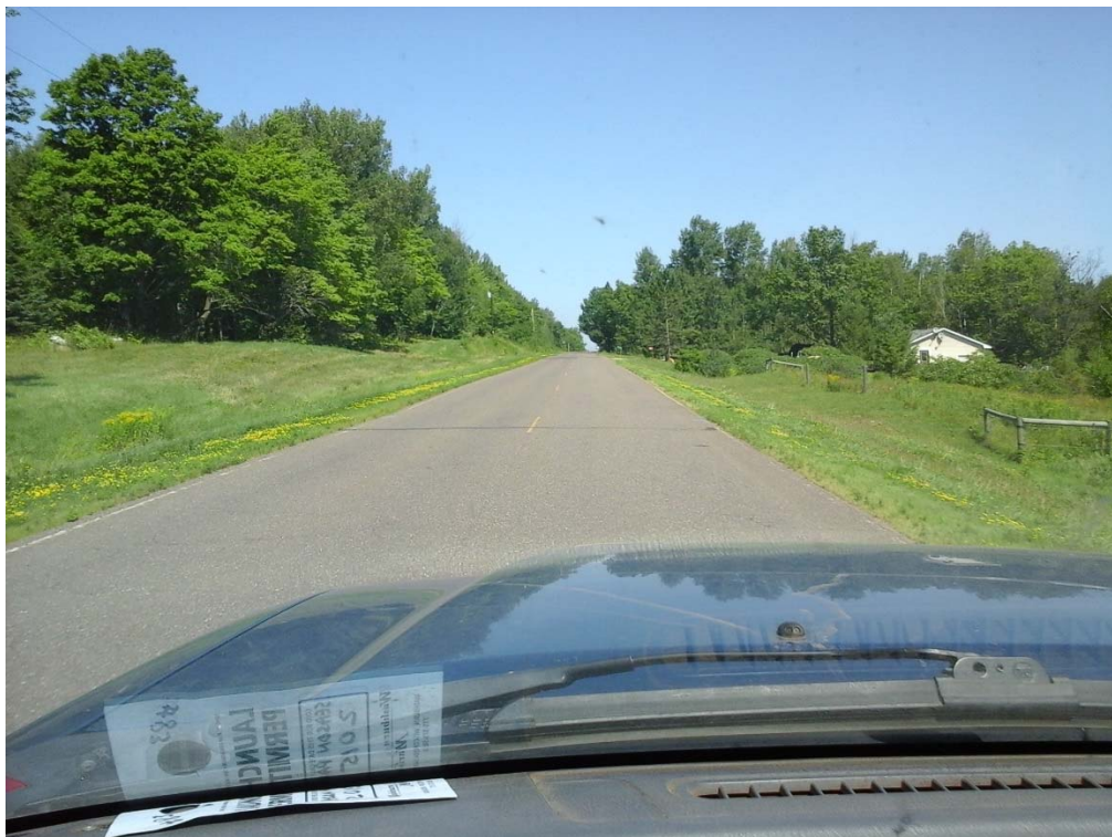
Figure 2- Little Sand Bay Road Looking North