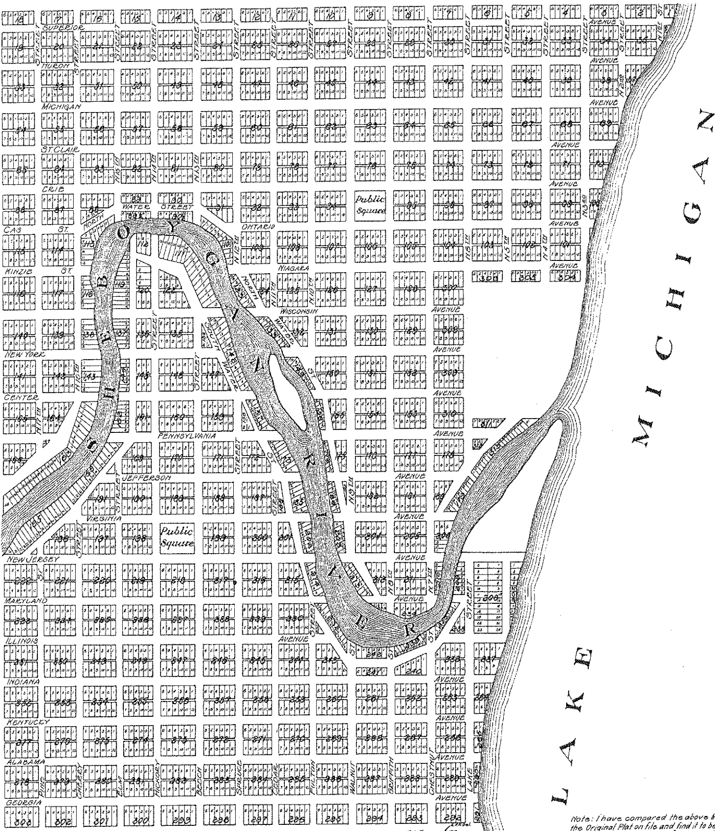
ORIGINAL PLAT OF SHEBOYGAN WIS. (COPY)