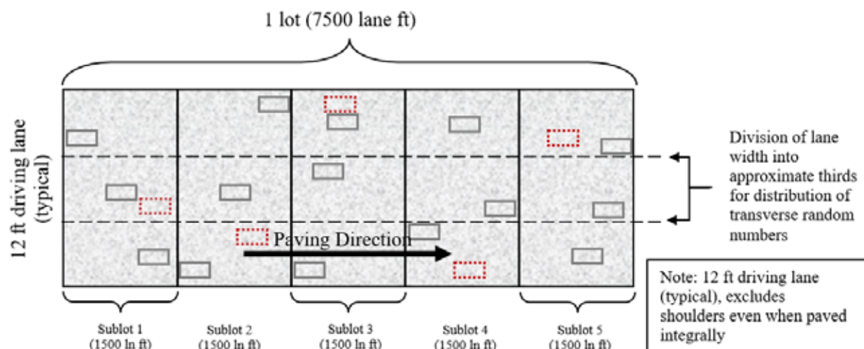
Figure 4: Locations of main lane HMA density testing (QC=solid lines, QV=dashed)

QC and QV nuclear density gauge readings will be statistically analyzed in accordance with Section 460.3.3.3 of the HMA PWL QMP SPV. (Note: For density data, if F- and t-tests compare, QC data will be used for the subsequent calculations of PWL value and pay determination. However, if an F- or t-test does not compare, the QV data will be used in subsequent calculations.)