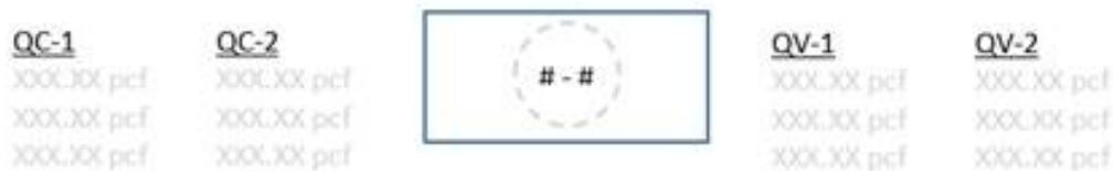
Figure 3: Layout of raw gauge readings as recorded on pavement

Photos should be taken of each of the 10 core/gauge locations of the test strip. This should include gauge readings (pcf) and a labelled core within the gauge footprint. If a third reading is needed, all three readings should be recorded and documented. Only raw readings in pcf should be written on the pavement during the test strip, with a corresponding gauge ID/SN (generalized as QC-1 through QV-2 in the following Figure) in the following format: