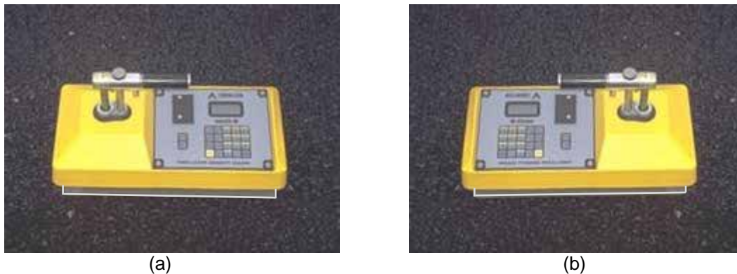
Figure 2: Nuclear gauge orientation for (a) 1 st one-minute reading and (b) 2 nd one-minute reading

The nuclear site is the same for QC and QV readings for the test strip, i.e., the QC and QV teams are to take nuclear density gauge readings in the same footprint. Each of the QC and QV teams are to take a minimum of two one-minute readings per nuclear site, with the gauge rotated 180 degrees between readings, as seen here: