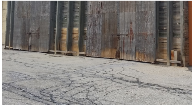
Apron and Pad