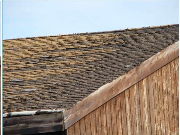
Ceiling and Roof