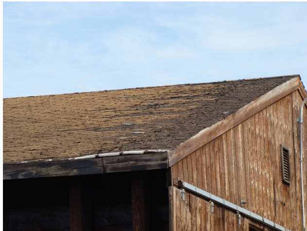
Ceiling and Roof