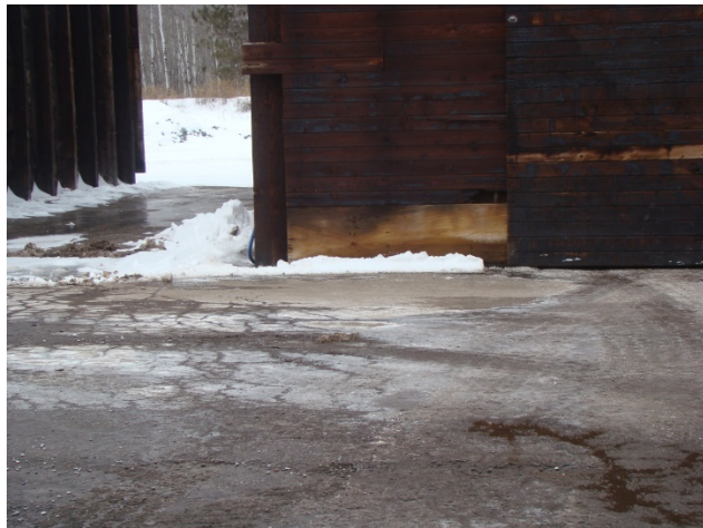
Apron and Pad